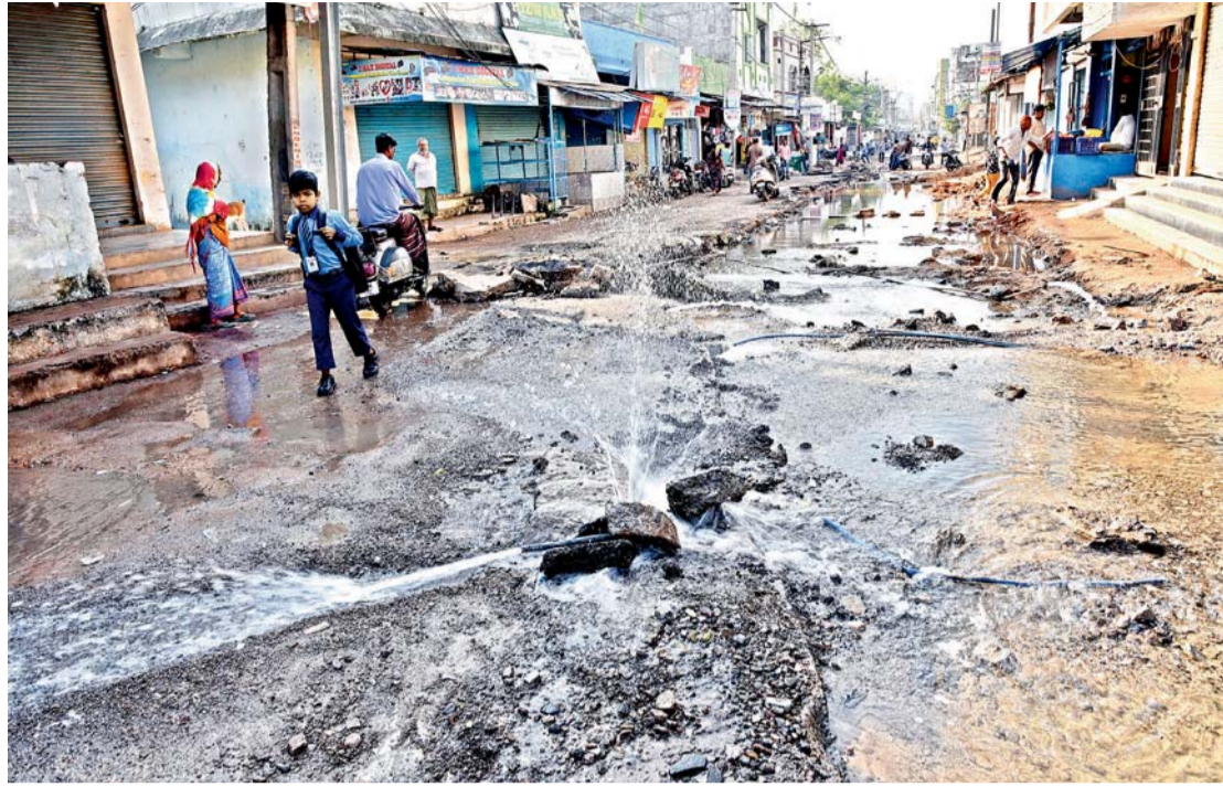
Drinking water flows on the road after workers dug up the stretch for laying road and in the process, damaged pipes at Vattepally in behind Falaknuma.