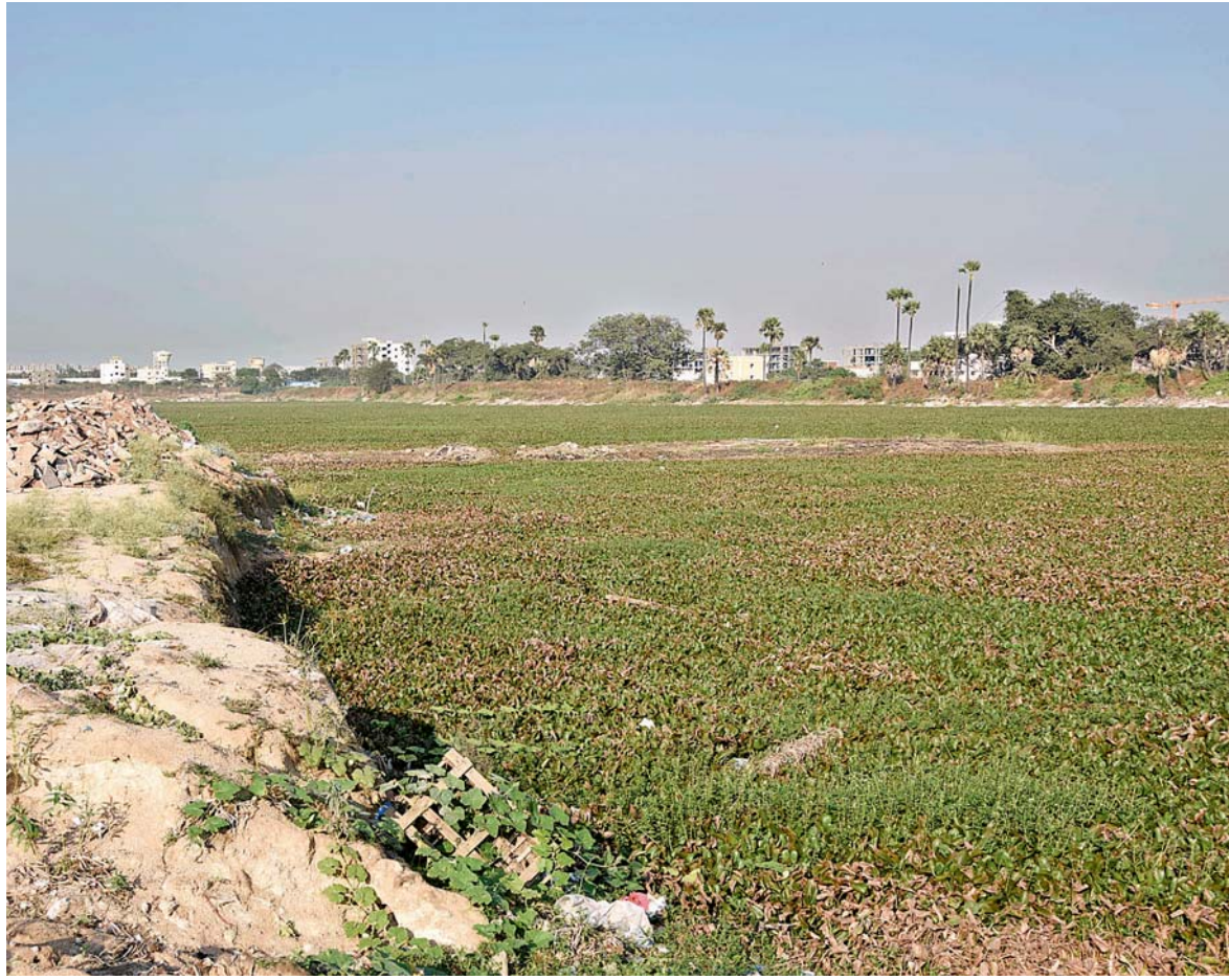
Work has begun to clean the Kapra lake of remaining hyacinth as well as the lakebed