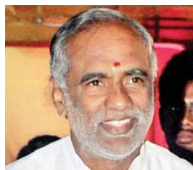
Chief Minister K. Chandrasekar Rao was exploiting the Rythu Bandhu scheme as a vote yielding machine whenever elections were around. Afterwards, he does not think of giving any aid to farmers and ditches them in the lurch.