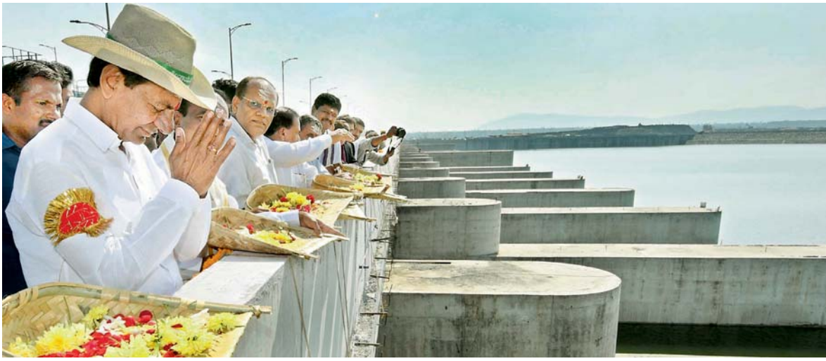
Chief Minister K. Chandrasekar Rao on Thursday visited the Kaleshwaram temple as part of his visit to the Medigadda barrage. He offered prayers to Goddess Godavari at the bathing ghat and later conducted rudrabhishekam to Mukteswara Swamy inside the temple. He also had an aerial survey of the barrage.