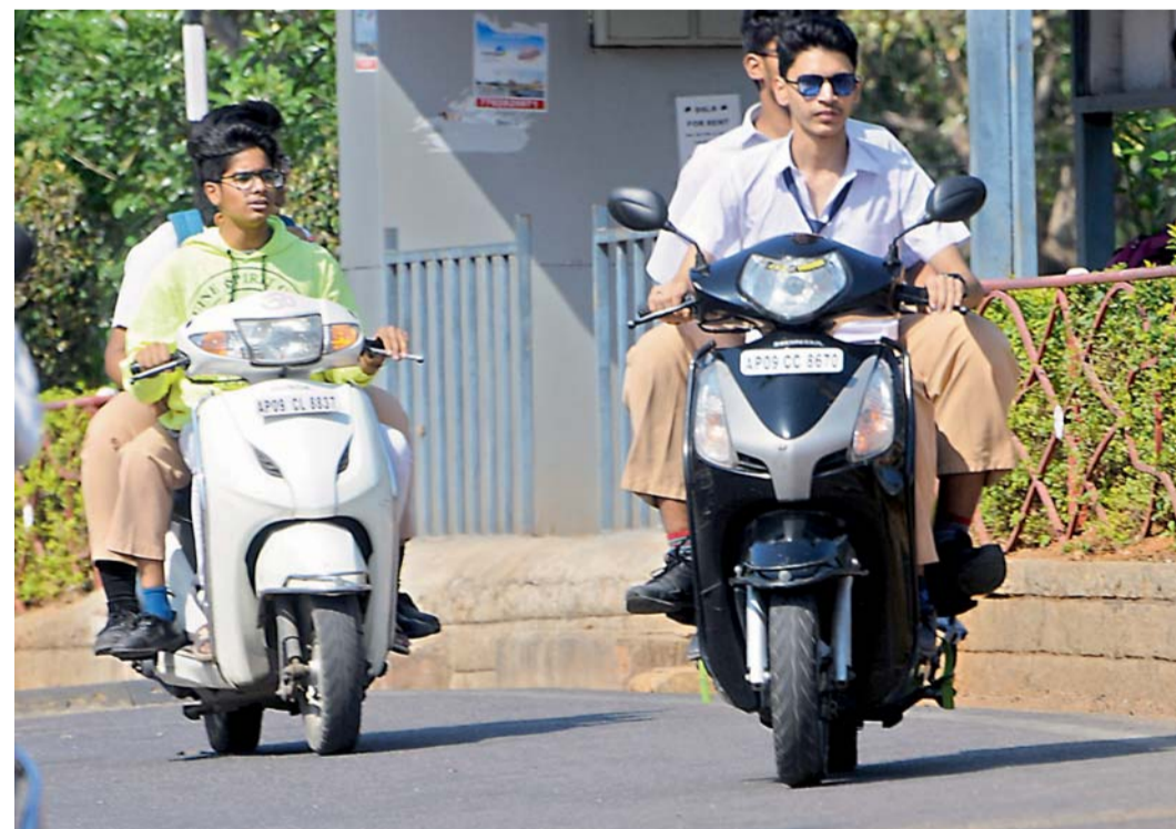
School ride two-wheeler breaking multiple traffic rules on Thursday. They are not wearing helmet and are riding triples.