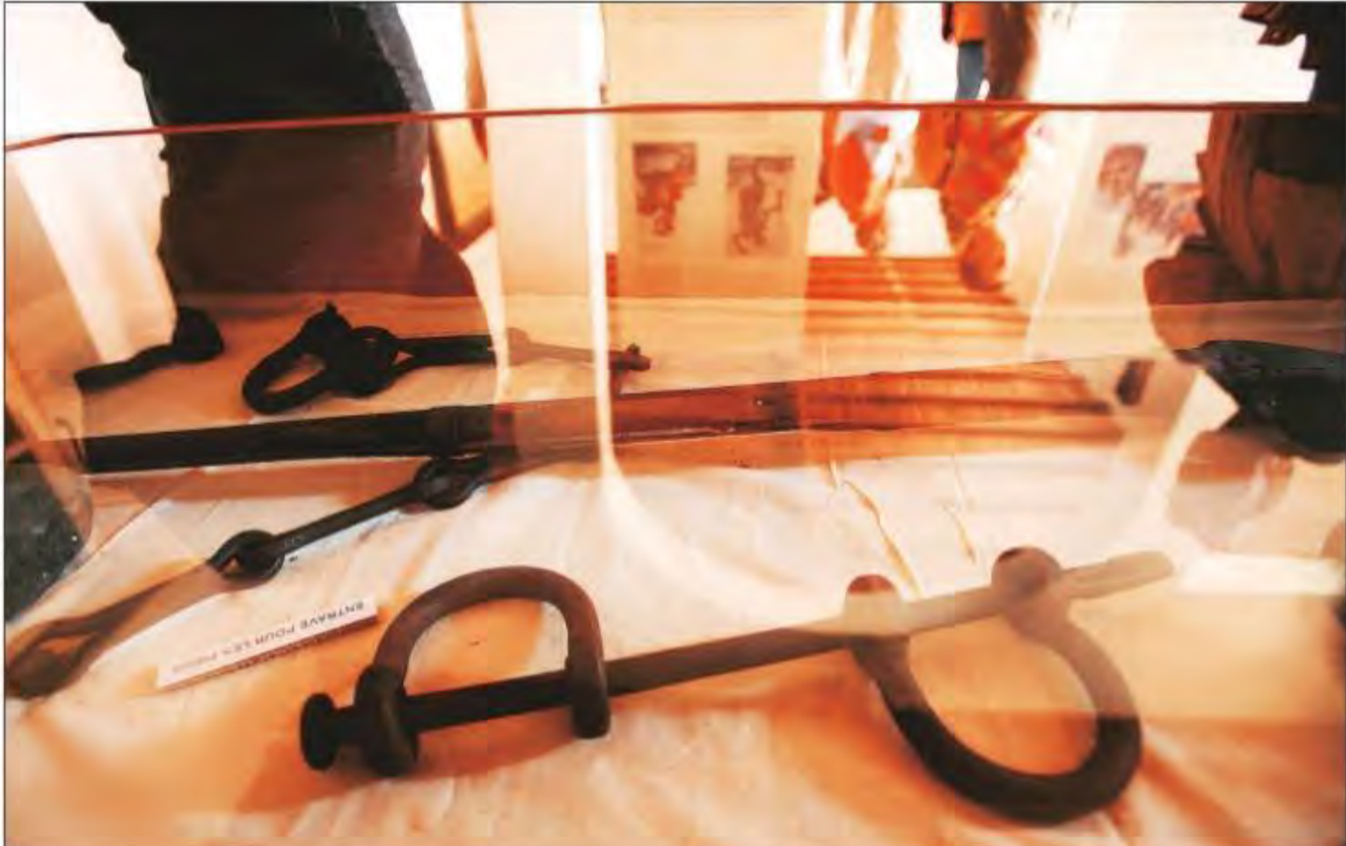
A display case containing iron leg shackles at the House of Slaves museum on Goree Island in Senegal.

But it was Glasgow, whose former rector, Robert Cunninghame Graham, had once been a slave, that kicked things off, setting a high bar. After releasing a forensic study in 2018 which showed that 23 donors, whose family fortunes came from slavery or trade