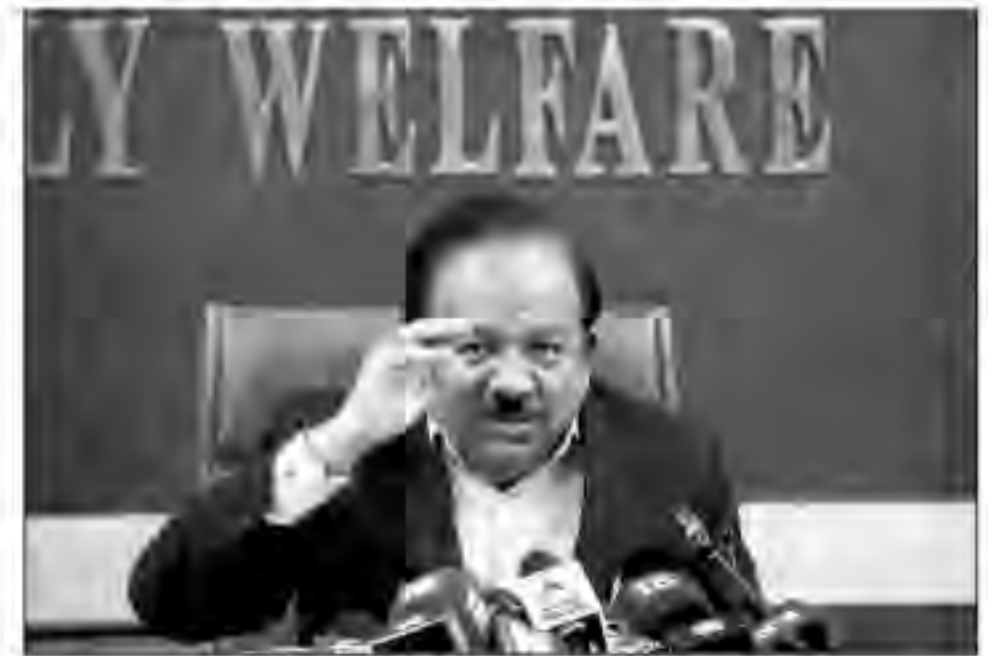
Union Health Minister Dr Harsh Vardhan at a press conference in New Delhi on Thursday.