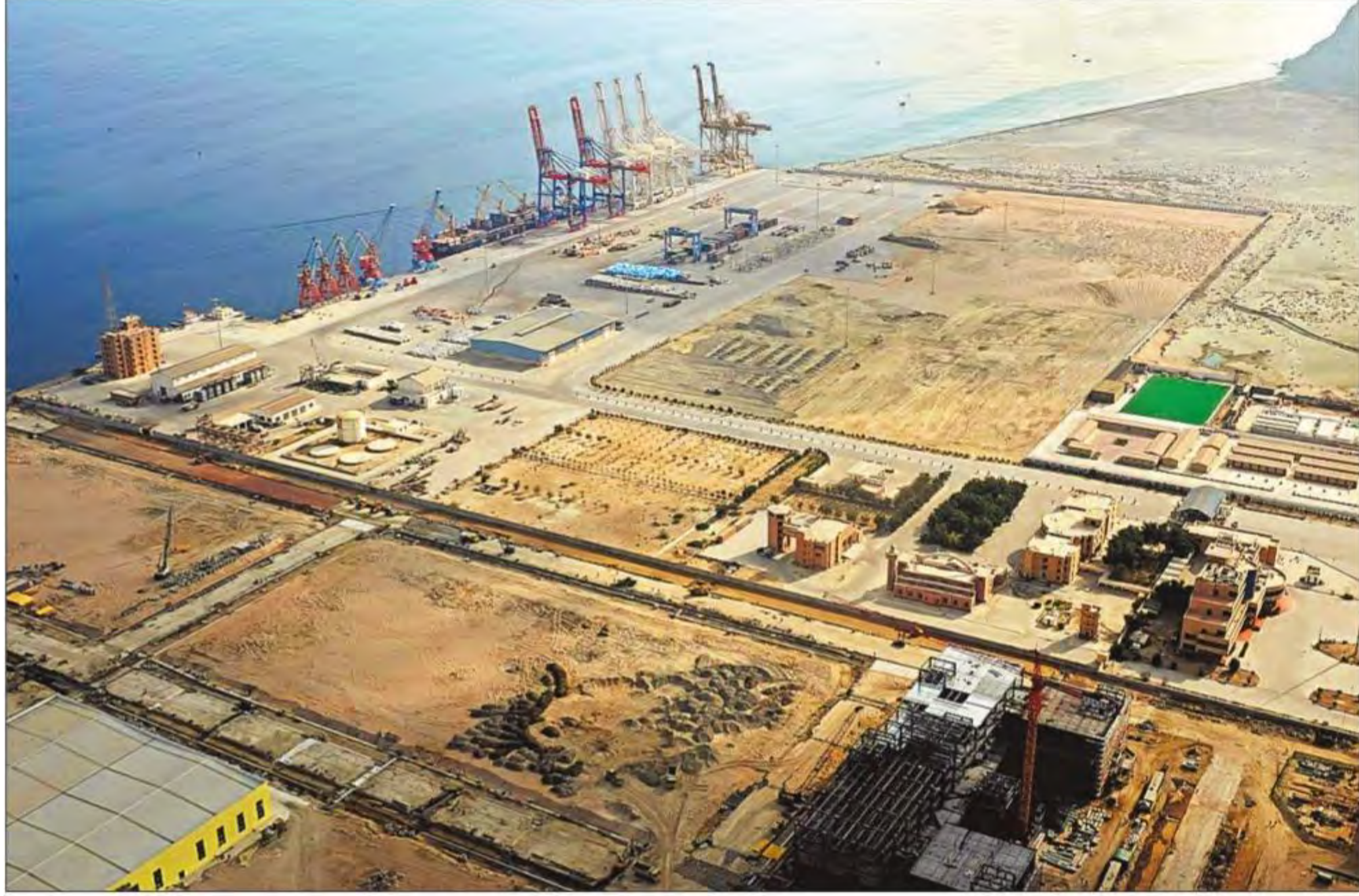
A general view of Gwadar port in Pakistan. The China-Pakistan Economic Corridor was referred to as a transformative economic programme.

Problems with investments under the Belt and Road Initiative show some of China's weaknesses abroad