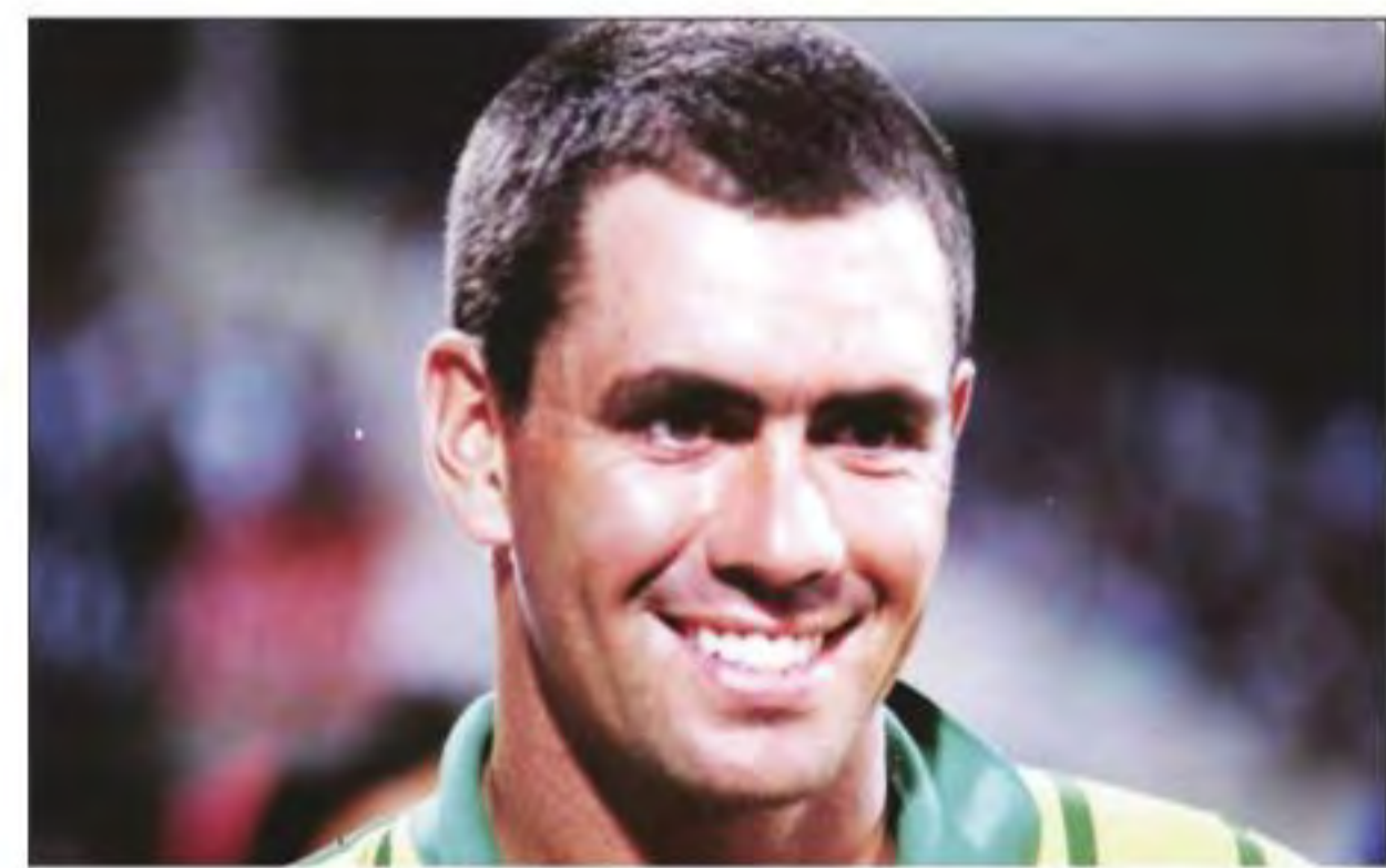
Former South African captain Hansie Cronje.