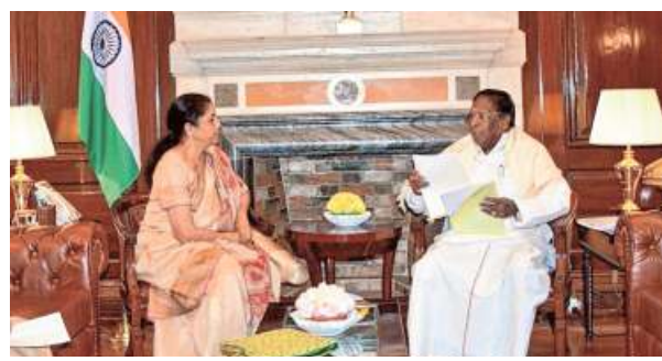
Puducherry Chief Minister V. Narayanasamy with Finance Minister Nirmala Sitharaman in New Delhi.

The assessment, done against the backdrop of Union Territories not coming under the purview of the Finance Commission recommendations for devolution of funds, noted that Central allocation to Puducherry is in the form of grants to meet the gap in resources and fi-