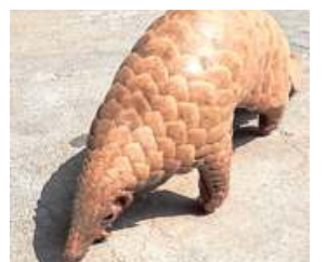
Pangolins are among the most trafficked animals in the world.

"In recent years, we have successfully busted pangolin-smuggling syndicates that involved poachers and smugglers from more than