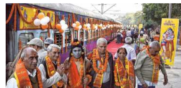
The Railways had introduced 'Shri Ramayana Express' in 2018 to cover destinations related to the epic. *FILE PHOTO

"The train will originate from different locations, north, south, east and west, so that people from across the country can avail its ser-