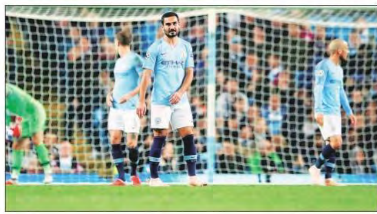
Manchester City Football Club committed serious breaches of the club licensing and financial fair play regulations, UEFA said in a statement.

"Simply put, this is a case initiated by UEFA, prosecuted by UEFA and judged by UEFA. With this prejudicial process now over, the Club will pursue an impartial judgment as quickly as possible and will therefore, in the first instance, commence proceedings with the Court of Arbitration for Sport at the earliest opportunity."