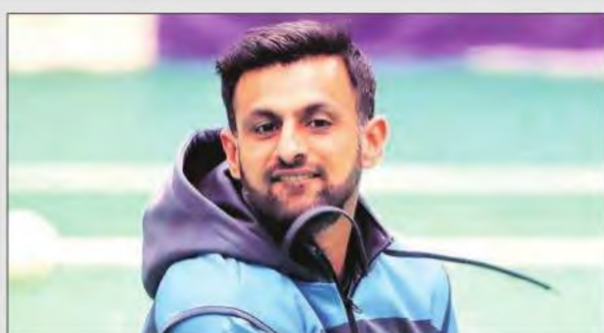
Shoaib Malik has retired from Tests and ODIs