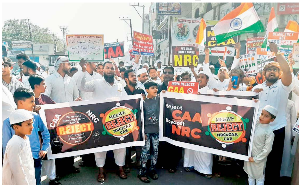
Anti-CAA protest at Mumtaz Bagh on Friday.