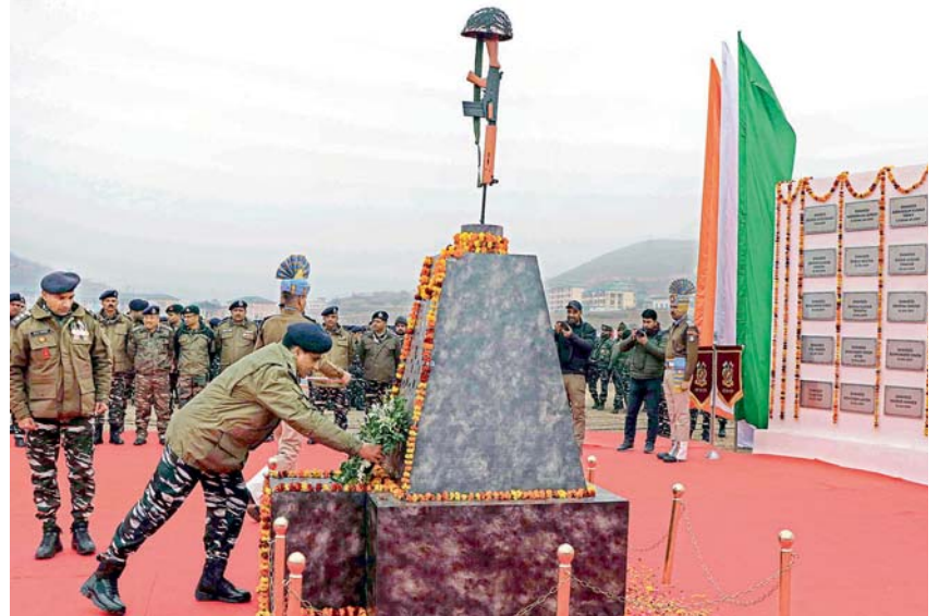
CRPF personnel pay tribute at a memorial to the 40 CRPF jawans, who were killed in the Pulwama terror attack in February last year, at Letapora of Pulwama District of South Kashmir on Friday.

Beijing: The death toll in China's novel coronavirus outbreak has spiked to nearly 1,500, including six medical workers, while the confirmed cases are now around 65,000 even as the cases outside Hubei province dropped. The coronavirus has posed a big threat to the medical staff in China as over 1,700 Chinese health workers were infected while treating the patients and six of them have died.