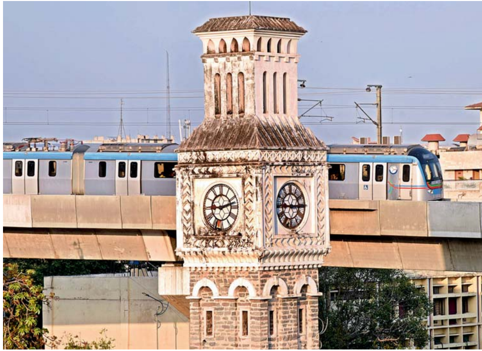
The historic Clock Tower in Secunderabad needs immediate repair works. The tower was inaugurated in February 1897. — GANDHI