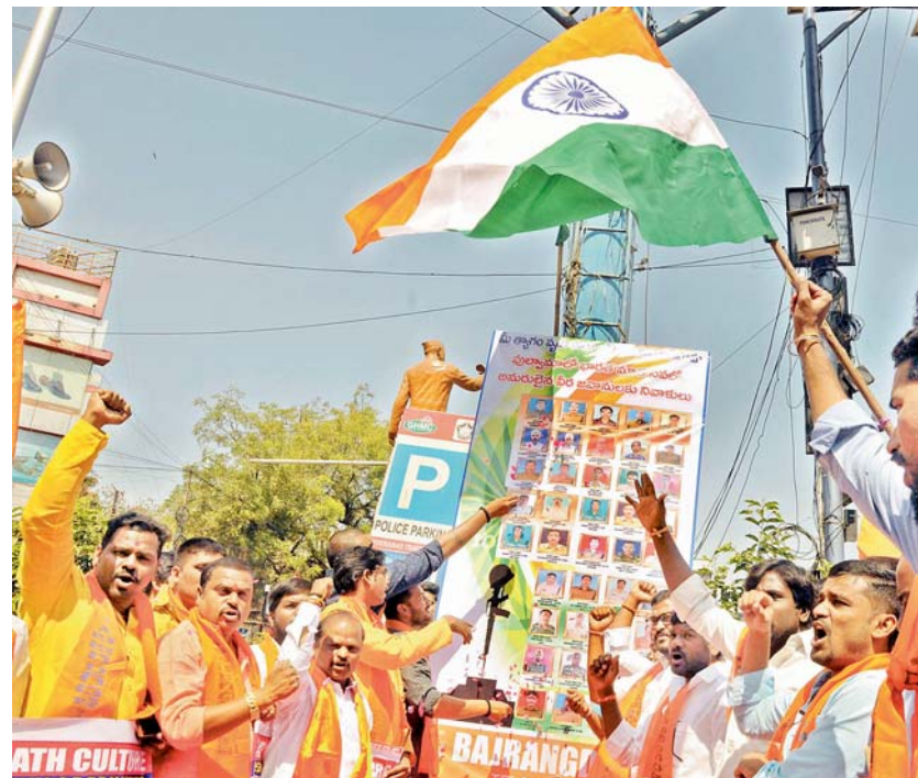
Bajrang Dal activists pay tributes to the fallen soldiers in Pulwama attack.