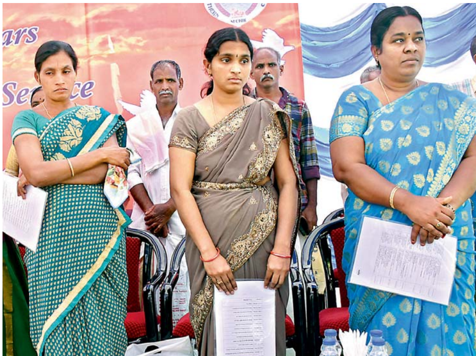
Family members of the fallen soldiers attend the remembrance ceremony on Friday.

He enrolled as a lawyer in the Madras High Court in 1952 and moved to Guntur when the High Court was set up there in 1953. In 1956, he moved to Hyderabad when the High Court of undivided AP was established. He was elevated as a Judge of the AP High Court in 1972 at 47 years of age. He was Chief Justice of the AP High Court in 1984 and 1985. In September 1985, he was transferred as Chief Justice of the Gauhati High Court from where he retired in November 1986.