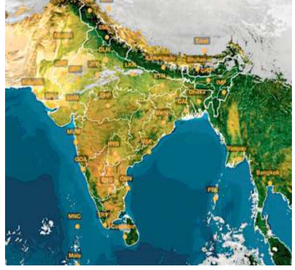
TEMPERATURE DATA: IMD, POLLUTION DATA: CPCB, MAP: INSAT/IMD (TAKEN AT 18.00 HRS)

RAINFALL, TEMPERATURE & AIR QUALITY IN SELECT METROS YESTERDAY