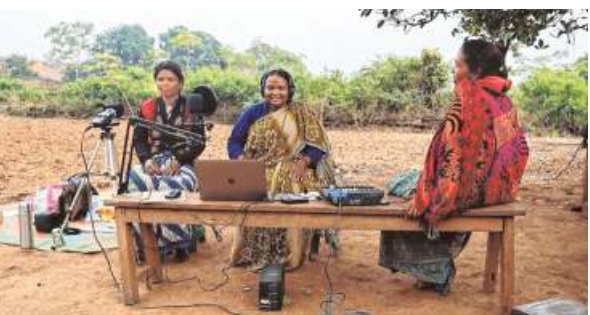
Taking initiative: Members of the Asur tribe operating a mobile radio in Jharkhand.

As the voice Dahan-Dahan Turrarr... Dang T inatang Turrarr... Noa Hake Asur Akhada Radio Enegebu Degeabu Siringabu Urrarr (Come, sing, dance and talk. This is Asur Centre Radio) is played out through loud speakers, the bustle at the weekly