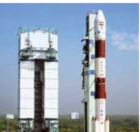
The upcoming launches include RISATs, Oceansat-3 and Resourcesat-3/3S.

ISRO was recently given a budget of nearly ₹13,480