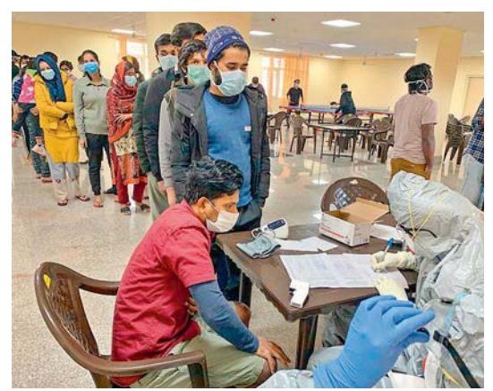
Indians who were airlifted from Hubei province of Wuhan, undergo screening at a quarantine facility set by up ITBP, at Chhawla area in New Delhi on Saturday.

The decision to discharge the patient was taken following the negative reports of the tests carried out at the virology institute.