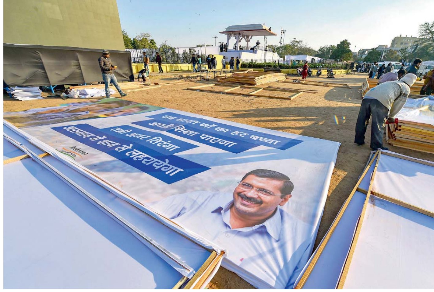
Preparation under way at Ramlila Maidan ahead of the oath-taking ceremony of Aam Aadmi Party government, in New Delhi on Saturday. Chief Minister-designate Arvind Kejriwal will take oath along with his cabinet on Sunday. Around 50 people from different walks of life who