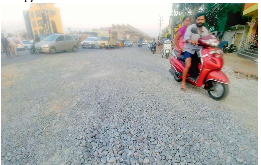
Gravel dumped for road laying at Kanchanbagh is strewn all over the thoroughfare, making driving difficult and dangerous. The road connects the airport with the east and north of the city.