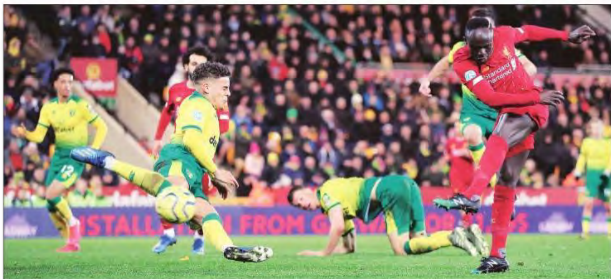
Liverpool, coasting towards a first English League title in 30 years, have qualified for the Champions League next season.