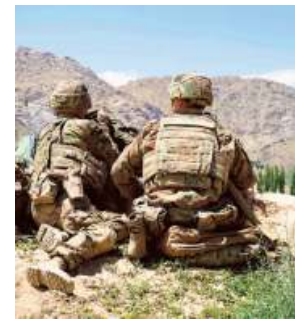
U.S. soldiers keeping watch in Nerkh district of Wardak province, in this file photo.

Commanders in Paktika and Nangarhar — two other provinces regarded as strongholds for the Taliban — also said they would continue their attacks as planned.