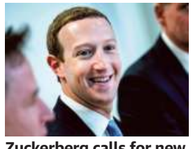
Zuckerberg calls for new big-tech regulator for EU

Facebook head Mark Zuckerberg called for a new type of big tech regulator as he lobbied the EU officials who have become the world's top enforcers on Silicon Valley. He emphasised the importance of better controlling hate speech and disinformation on platforms — all without muzzling free speech. Facebook stressed that the way to limit unwanted speech was to make sure that platforms put the right systems in place, not by holding them liable for the speech itself. AFP