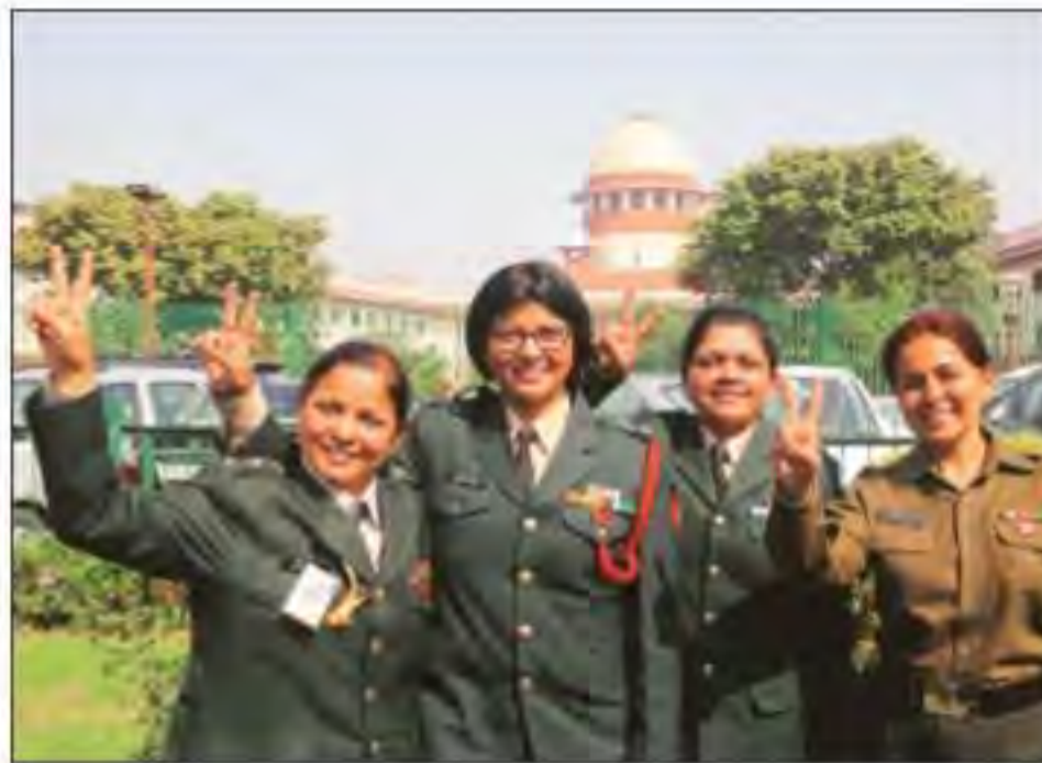
The petitioners outside Supreme Court, Monday. Amit Mehra

CALLING FOR a "change in mindsets", the Supreme Court, in a momentous ruling Monday, directed that women officers of the Indian Army, serving under Short Service Commission, be considered for grant of Permanent Commission, irrespective of tenure of service, and also for command posts in non-combat areas since "an absolute bar on women seeking criteria or command appointments