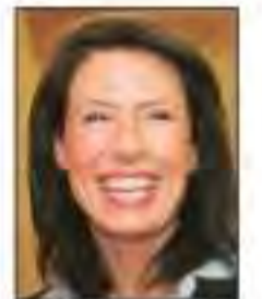
UK Labour MP Debbie Abrahams

denied the claim and said Labour Party MP Debbie Abrahams had landed in Delhi despite being informed that her visa "had been cancelled much earlier". "She had been duly informed about