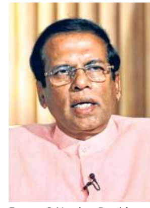
Former Sri Lankan President Maithripala Sirisena

The formation of the new alliance effectively signals a re-consolidation of forces that were earlier aligned to the SLFP, one of Sri Lanka's fore-