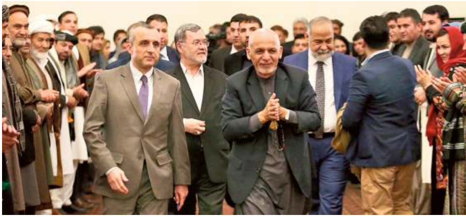
Victory lap: A December 22 photo of Afghanistan's incumbent President Ashraf Ghani in Kabul after he won a slim majority of votes in preliminary results of the presidential election.

His intent to try to form a separate government brought back memories of the 2014 election, which also saw Mr. Ghani declared winner and Mr. Abdullah protest. That time, Mr. Abdullah's supporters held violent demonstrations before the U.S. finally intervened to broker an awkward deal between the two rivals.