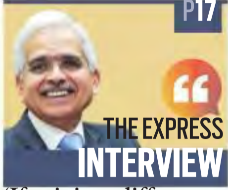
'If opinions differ... better I address govt directly, internally' SHAKTIKANTA DAS RBI GOVERNOR