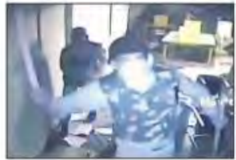
CCTV grab of security personnel smashing a camera

Over the last few days, several video clips from Jamia's CCTV footage have been released, which show uniformed