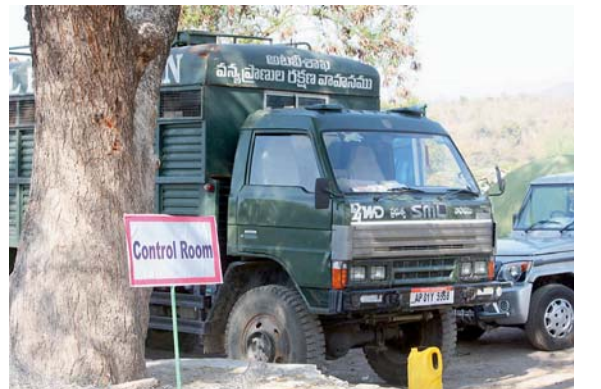
Forest officials set up a control room to monitor the situation that arises with the stray tiger movement in the Tamsu (K) village in Adilabad district on Tuesday.

Forest rescue staff is present in and around Tamsu (K) village and Gollaghat area and a tiger rescue van has been stationed and control room set up in Tamsu (K) village. Base camps with forest staff have been set up at some places and are restricting the movement of villagers and vehicles inside certain forest areas.