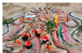
The site where occult ritual was performed.