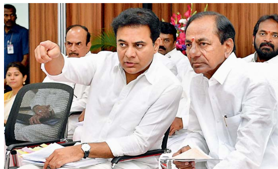
Chief Minister K. Chandrababbarao listens to his son and minister K.T. Rama Rao during a meeting in Hyderabad on Tuesday.

At the state-level municipal conference held here on Tuesday, Mr Rao said the onus and responsibility of making towns and cities in Telangana state ideal in the country is on newly elected mayors, chairpersons, councillors,