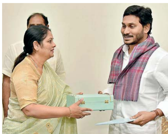
Veteran Tollywood actress Jayasudha gives her son's wedding card to Chief Minister Y.S. Jagan Mohan Reddy at Tadepalli camp office on Tuesday.

The state administration and the Chief Minister had earlier thought that delimitation of Assembly constituencies will be completed in a year. They decided to form new districts after