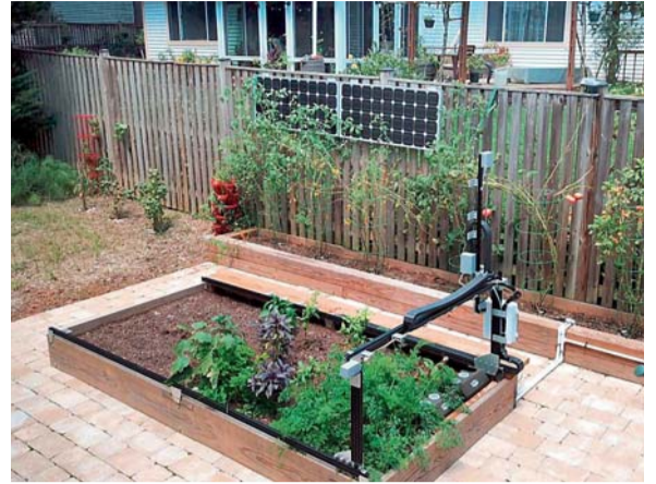
A picture of the robotic farming device installed in the garden.

This type of farming is best suited to people living in independent houses with open spaces or gardens around and where there will be no need of any third person interference.