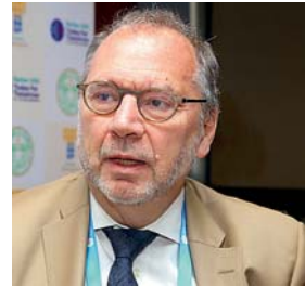
Dr Peter Piot

Asymptomatic carriers of Covid-19, the name given to the coronavirus strain that has claimed over 1,700 lives, mostly in China, are a cause for concern and India needs to be vigilant and further strengthen its screening and testing process as there is concern that there could be cases which are not yet detected, explained Dr Peter Piot, director of the London School of Hygiene and Tropical Medicine, who was in Hyderabad to attend BioAsia 2020. Excerpts from a conversation with Dr Piot.