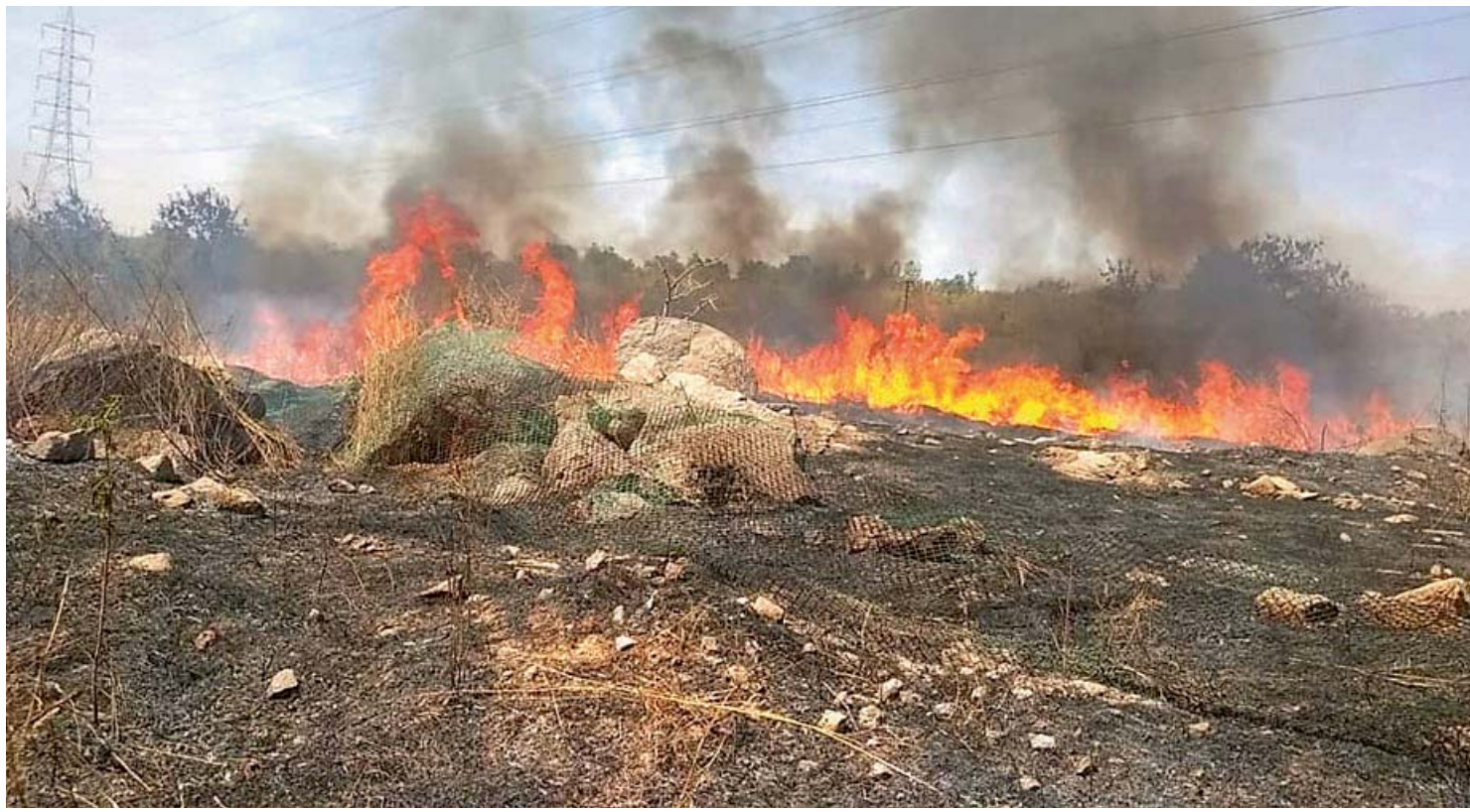
Fire breaks out in the Mushroom rock area of the University of Hyderabad campus

The students were asked to remit the penalty amount to Gurbaksh Singh Students Assistance Fund (GBSSAF) within 10 days.