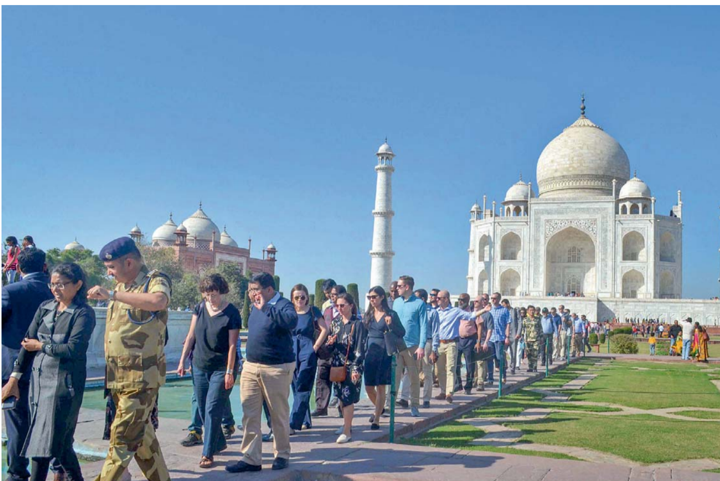
American security personnel along with CISF and ASI personnel visit the historic Taj Mahal for inspection ahead of US President Donald Trump's visit, in Agra, on Tuesday. President Trump accompanied by First Lady Melania Trump will pay his maiden visit to India from February 24.