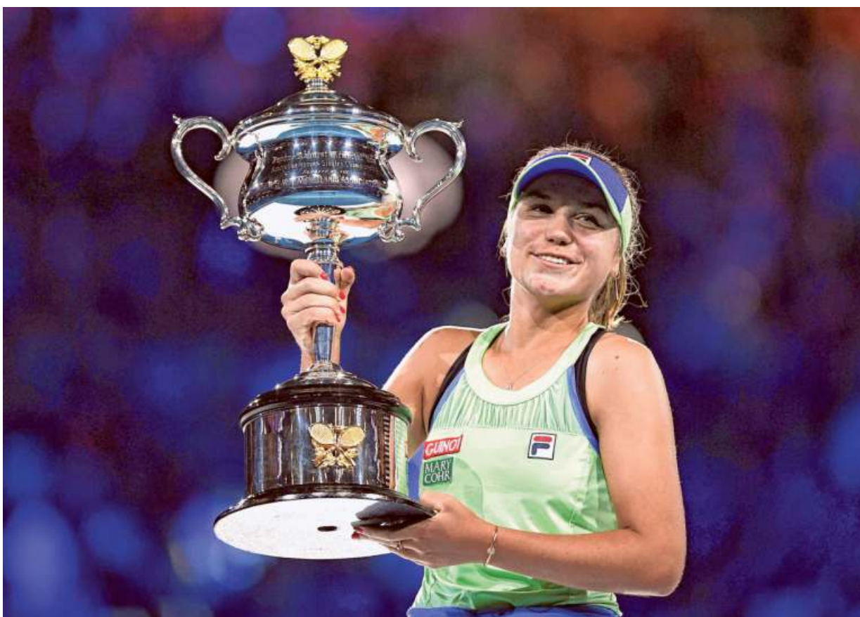
In wonderland: Sofia Kenin's dream run ended with her holding up the Daphne Akhurst Memorial Cup on Saturday.

It's official! "I just want to say my dream has officially come true... I'm just so grateful standing here," Kenin said after lifting the Daphne Akhurst Memorial Cup. "I'm looking forward to coming back here next year... These past two weeks have been the best two weeks of my life." Kenin and Muguruza produced a fitting and intense final under the closed roofs of a packed Rod Laver Arena. Muguruza had arrived in Melbourne suffering from a virus that forced her to quit the Hobart International, but the Spaniard was soon back to playing to her strength which helped her reach the top of the women's rankings in 2017. Some of the inconsistency that led to her slipping to 36th last year resurfaced against Kenin, however, as the Spaniard blew hot and cold with her serve, getting 57% of her first serves in while mixing her nine aces with eight double-faults.