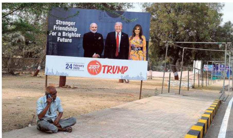
Welcome sign: A hoarding featuring U.S. President Donald Trump, wife Melania and Prime Minister Narendra Modi in Ahmedabad on Wednesday.

'Big deal later' Speaking in Washington DC, Mr. Trump spoke in a similar vein. "We can have a trade deal with India but I am saving the big deal for later on. We're doing a very big trade deal with India...we'll have