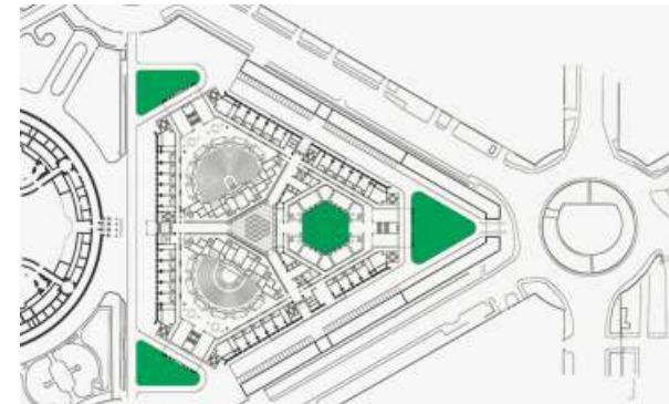
Plan for green belt in the new Parliament building as submitted by the CPWD for environmental clearance.

The benefit of the project would be "social", according