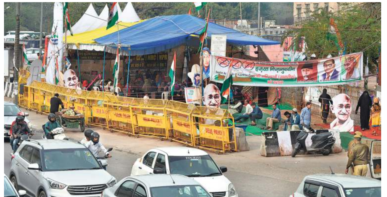
Women sitting on a dharna against the CAA at Hazrat Nizamuddin in the city on Wednesday.