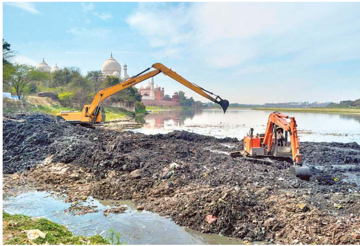
Earthmovers remove debris from the Yamuna bed ahead of U.S. President Donald Trump's visit, in Agra on Wednesday.