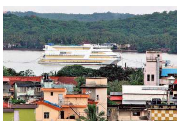
Lifeline: Every casino, the Ports Minister said, employs over 400 people, and they also help the State treasury. ■ FILE PHOTO

"I still remember our former chief minister Manohar Parrikar saying that