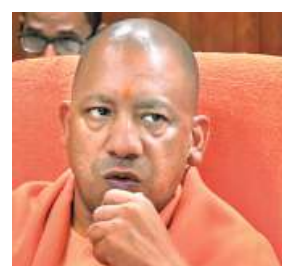
CM Yogi Adityanath

"We demand the immediate resignation of U.P. CM Yogi Adityanath as his pre-