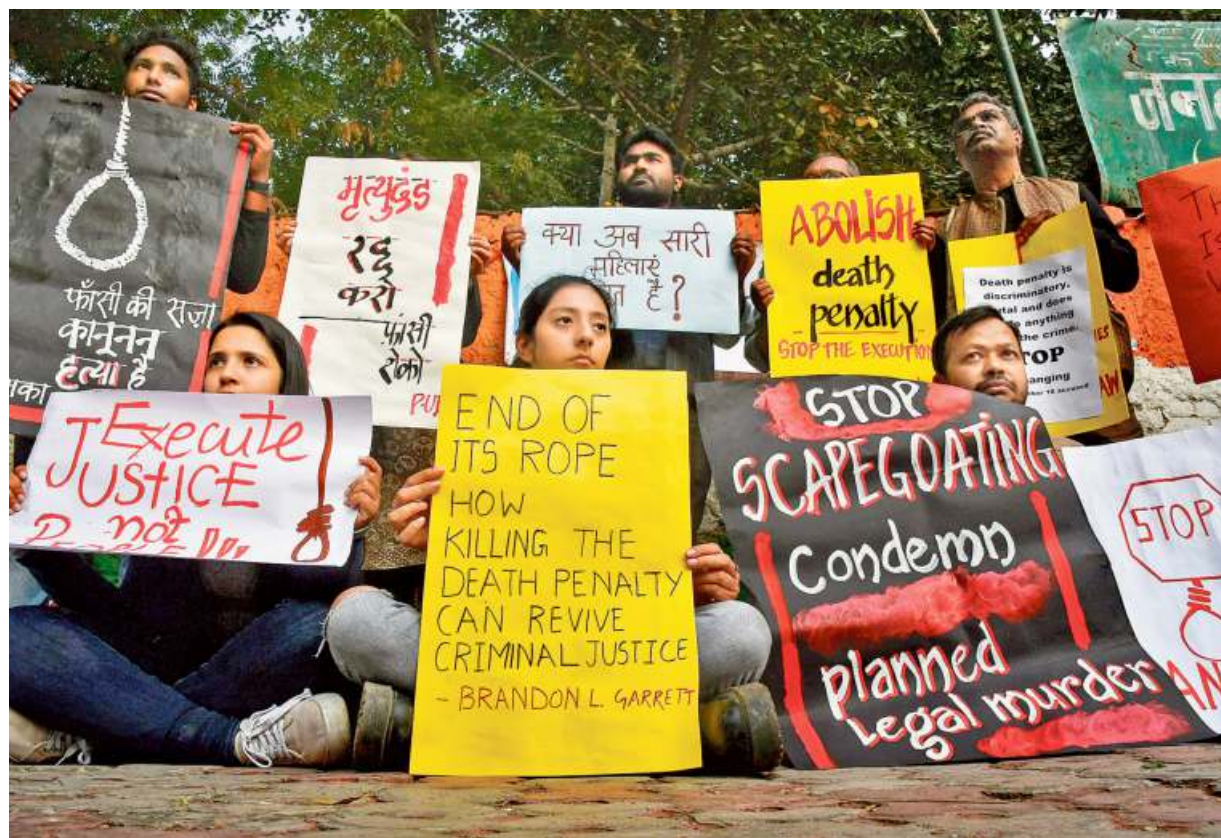
Members of Peoples Union for Democratic Rights protesting against death penalty for gang rape and murder, at Jantar Mantar on Wednesday.