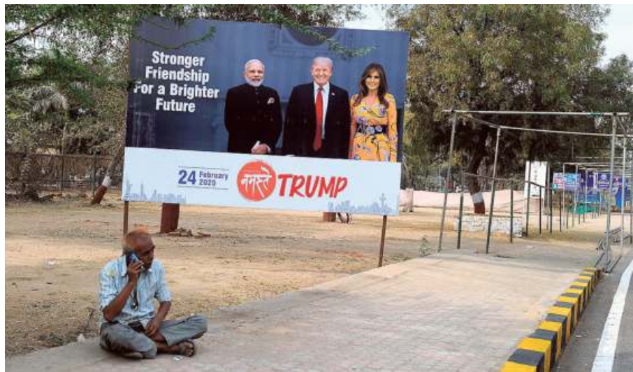
Welcome sign: A hoarding featuring U.S. President Donald Trump, wife Melania and Prime Minister Narendra Modi in Ahmedabad on Wednesday.

Speaking in Washington DC, Mr. Trump spoke in a similar vein. "We can have a trade deal with India but I am saving the big deal for later on. We're doing a very big trade deal with India...we'll have