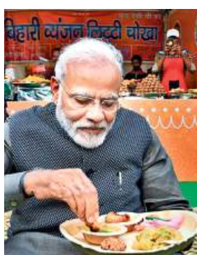
PM Narendra Modi relishes litti-chokha at Hunar Haat on Wednesday.

Modi, who was there for 50 minutes, ate 'litti-chokha', a dough ball made of whole wheat flour and stuffed with 'sattu', and paid ₹120 for it.