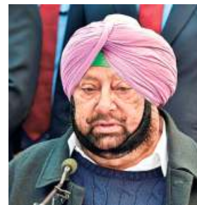
CM Amarinder Singh

"The Congress government should not run away from the debate. The Opposition should be given appropriate time during the budget session to take up