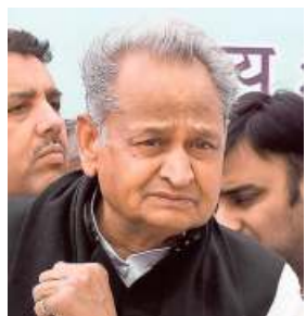
CM Ashok Gehlot

The Bench, which also comprised Justices B.R. Gavai and Surya Kant, also directed the apex court ap-