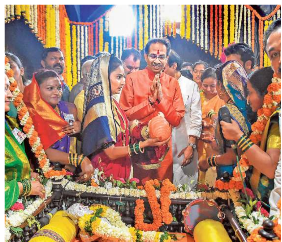
Chief Minister Uddhav Thackeray visiting Shivneri Fort, the birthplace of Maratha warrior king Chhatrapati Shivaji Maharaj, on his birth anniversary, in Pune on Wednesday.

"Mopa can be a different set up all together, we can have a live gaming zone there. But in my opinion, the casinos should continue in the Mandovi river," he added.