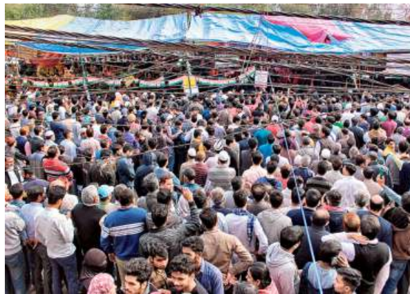
Protesters at Shaheen Bagh on Wednesday.