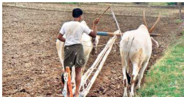
Changes made after consultations with States, says Minister.

In another significant step, enrolment in the two schemes has also been made voluntary for all farmers, including those with existing crop loans. When the PMFBY was launched in 2016, it was made mandatory for all farmers with crop loans to enrol for insurance cover under