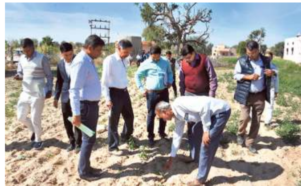
Members of the Central team inspecting damaged crops at a village in Jodhpur division on Wednesday.

The team members inspected the damaged wheat, gram, castor, taramira, cummin and isabgol crops in Jaisalmer, Barmer, Jalore and Jodhpur districts on Tuesday and Wednesday. Crops in an area measuring 3.71 lakh hec-