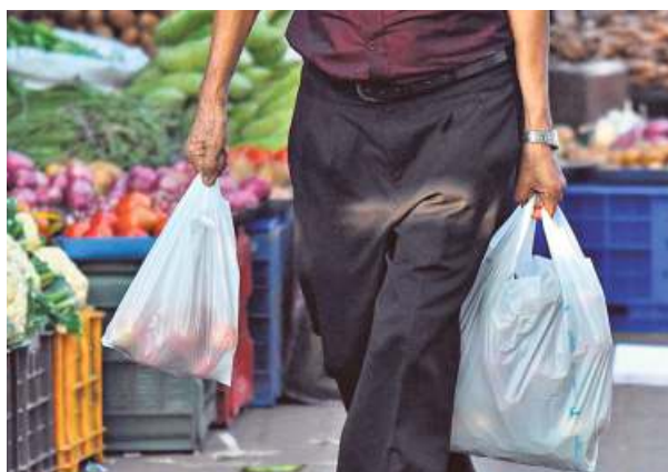
Following initial success after the State government banned use of single-use plastic in March 2018, the drive lost momentum.

After becoming Environment Minister himself, Mr. Thackeray conducted a review of the ban in January,