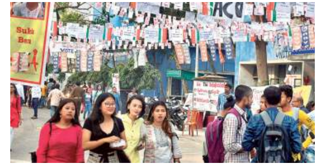
Students at Jadavpur University in Kolkata on Wednesday.