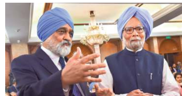
Old hands: Manmohan Singh with Montek Singh Ahluwalia, left, at a book launch.

"We have today a government that does not acknowledge that there is such a word as slowdown. I think