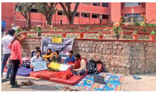
The IIMC management appealed to the students to withdraw their strike.

The students, on the second day of their strike, said that IIMC had agreed to form a committee to look into the matter but alleged that the institute was not serious as an earlier committee formed to look into the fee structure had not submitted any report