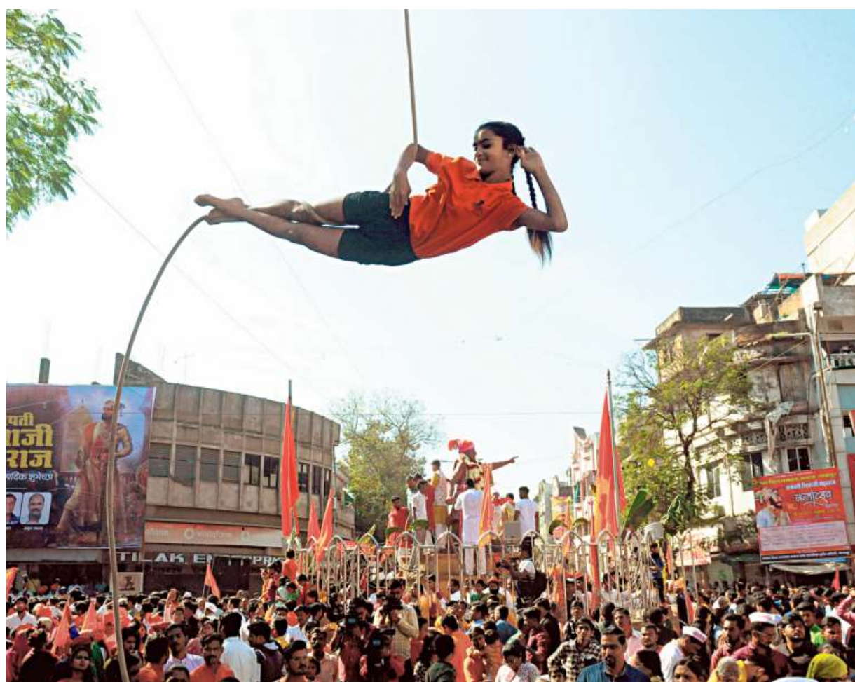
Joyous celebration: An acrobat demonstrates her skills at a rally to mark the 390th birth anniversary of Maratha warrior Chhatrapati Shivaji Maharaj in Nagpur on Wednesday.