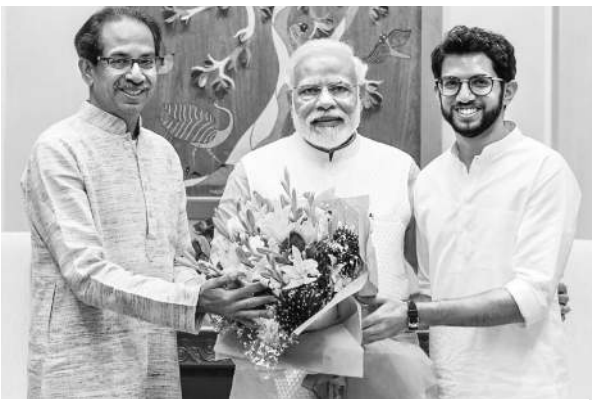
Prime Minister Narendra Modi with Maharashtra Chief Minister Uddhav Thackeray and his son and State minister Aaditya Thackeray in New Delhi