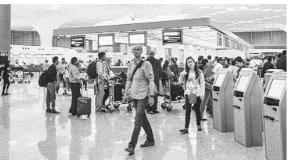
The facility will be operated by cargo handling service provider and MIAL's business partner, Cargo Service Centre

It connects to over 500 cargo destinations across 175 countries through 60 air-