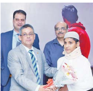
12-year-old boy from Bangladesh with team of doctors after a giant nerve sheath tumour covering the entire lower part of the neck, was removed successfully in a 12-hour marathon single-stage surgery by a medical team at Gleneagles Global Health City, Chennai.