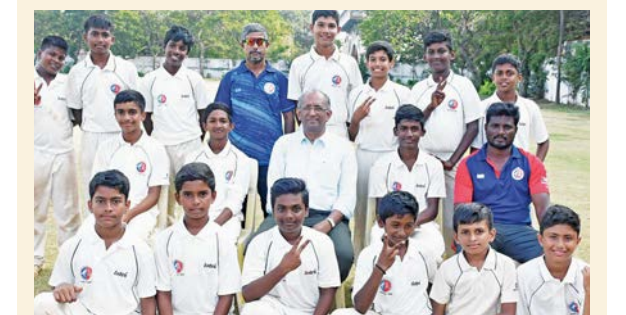
Ramachandrapublic School, winners of the under-14 TNCA city schools tournament for B. Somasundaram Trophy.