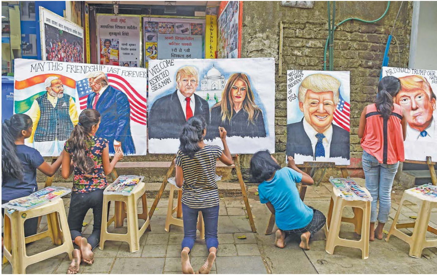
Children make paintings depicting US President Donald Trump, First Lady Melania Trump and PM Narendra Modi, ahead of former's maiden official visit to India in Mumbai on Friday. — PTI

Following the incident, villagers took to street and blocked Karanjia-Barikuda main road by placing burning tyres on the road.