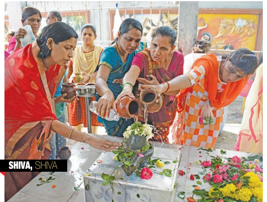
Devotees offering prayers at Gangadeeswarar temple in Purasawalkam on the occasion of Maha Shivaratri.

Delivering the second convocation address of the Rajiv Gandhi National Institute of Youth Development at nearby Sriperumbudur, he also underlined the role of youths and parents in the nation's development. —PTI