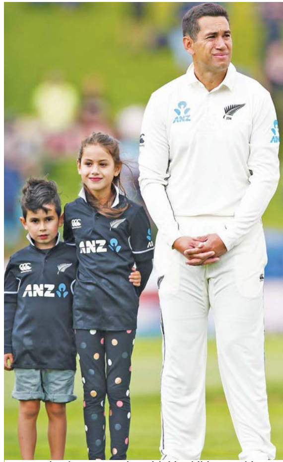
New Zealand's Ross Taylor with his children on his 100th Test prior to the first Test match against India at the Basin Reserve in Wellington on Friday.

to try and nitpick that would be not the smartest. With the assistance of the pitch it was how we would try to make him play and he's so strong on the stump line. I probably missed a little bit but managed to get the edge which was good." The extra bounce that he generates has been his go to strategy since he came into the ODI side. "I tried to keep it simple the last few weeks. My role is to make them play and with that extra bounce bring them forward. There was a lot of assistance with pace and bounce and swing and seam. That simplifies my game plan to try to hit a good area. I stayed pretty relaxed which helped," he said. The height also helps him to bowl slightly more fuller than other seam bowlers, something that got rid of Pujara and Hanuma Vihari. "With my height, I can afford to go a fraction fuller, especially out here with the extra bounce. I try to make guys commit to play off the front-foot. "In that second spell, the first half of it, there were a lot of balls left on length. How do you commit them on the front-foot (is the key) and if it does swing or seam, you're in with a chance of bringing the edge in." — PTI