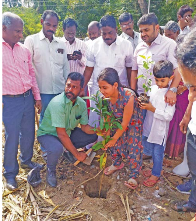
Residents of Rayala Nagar take care of saplings planted under Miyawaki method at Ramapuram.

"The saplings planted here (Second Street in Rayala Nagar (Ward 155) in Ramapuram (Zone 11-Valasaravakkam) were donated by Trees Foundation. They are currently being watered twice a day.