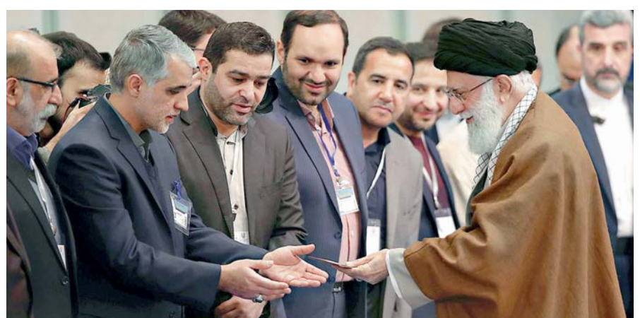
Supreme leader Ayatollah Ali Khamenei at a polling station in Tehran on Friday

the expense of President Hassan Rouhani, who was re-elected in 2017 promising more freedoms and the benefits of engagement with the West. After three hours of voting, five million of the 58 million people eligible to vote had done so, a statement by the interior ministry said. Around half of the 16,033 hopefuls will contest the 290 seats up for grabs across 31 provinces after the Guardian Council barred thousands of would-be candidates, mostly moderates and reformists.