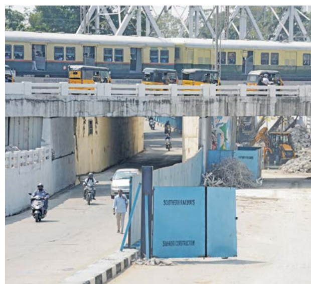
Renovation work at RBI subway on Rajaji Salai in Chennai goes on at a tardy pace inconveniencing commuters.

Flood Wall and Soil Erosion Scheme for Yanam had also been stalled by the Lieutenant Governor without any justification. Reacting to the minister's allegations, Bedi dubbed them as false and said it was a clear case of spreading misinformation. On the charge that she was blocking implementation of various schemes ever since she assumed office in 2016 and that he would launch legal action against her, the former IPS officer said she was not blocking any financially sound and professionally vetted proposals.