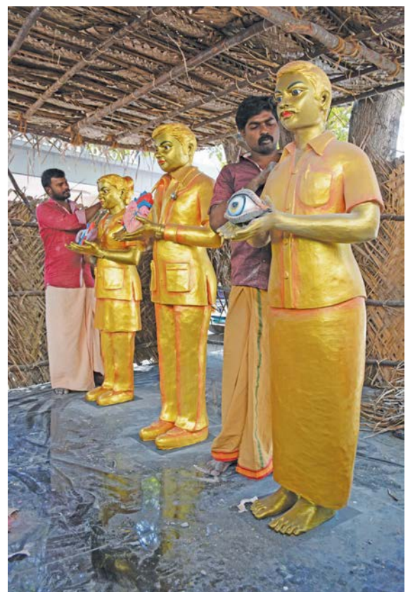
Workers creating sculptures to create awareness on organ donation as part of 'My hospital my pride' project at Kilpauk Medical College and Hospital.