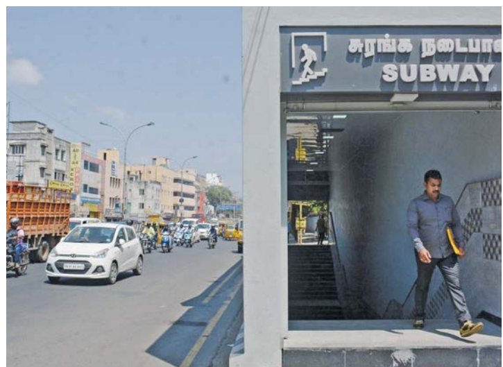
Thousand Lights subway opened after renovation on Anna Salai on Friday.