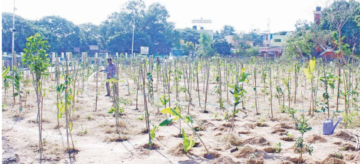
Green initiative at Kotturpuram.