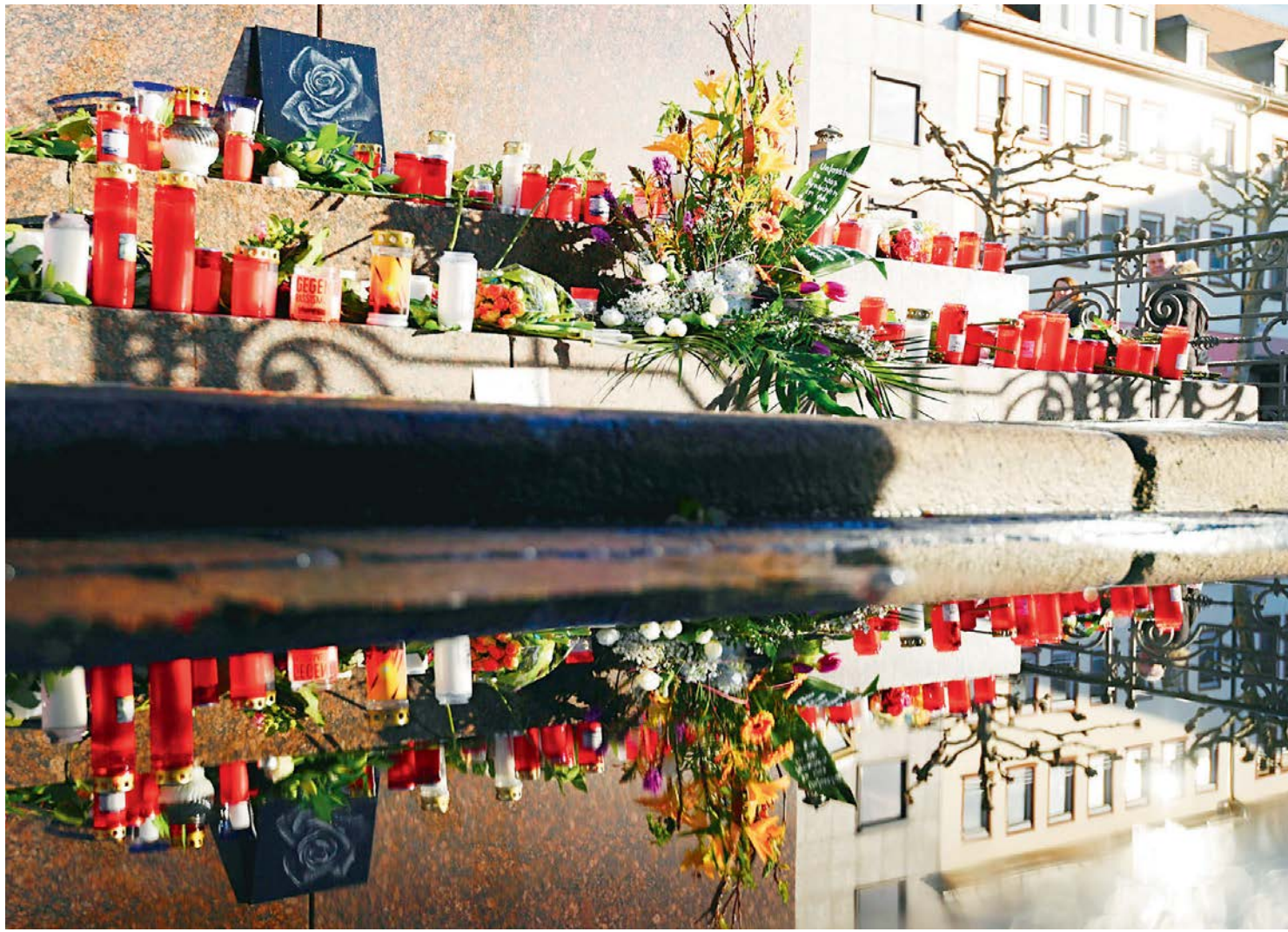
Flowers and candles are set around a monument for the brothers Grimm, Hanau's best known sons, at the marketplace in Hanau, Germany, on Friday as thousands took part in vigils across the country after a gunman with apparent far-right beliefs went on a killing spree.