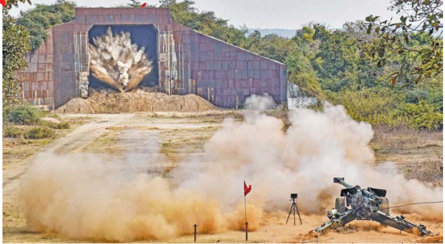
Sarang cannon being successfully tested in the LPR firing range of Khamaria, in Jabalpur district of Madhya Pradesh, on Friday