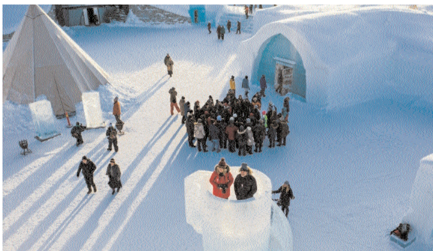
Sweden's ice hotel which is built every October from the frozen waters of the nearby river Torne.

Jukkasjarvi, Feb. 21: High above the Arctic Circle and nestled in the snow-dusted forests of northern Sweden, gaggles of tourists gathered on a February morning for a glimpse of hallways, bedrooms and a wedding chapel sculpted from ice, part of the 30th incarnation of Sweden's ice hotel. Stopping in blue-white hallways to take snaps of a chandelier and ornately decorated bedrooms entirely carved from ice, the tourists are among the 50,000 day visitors to the hotel every year, founded in 1989 by a hotelier looking to attract visitors to the remote town of Jukkasjarvi, 200 kilometers north of the Arctic Circle.