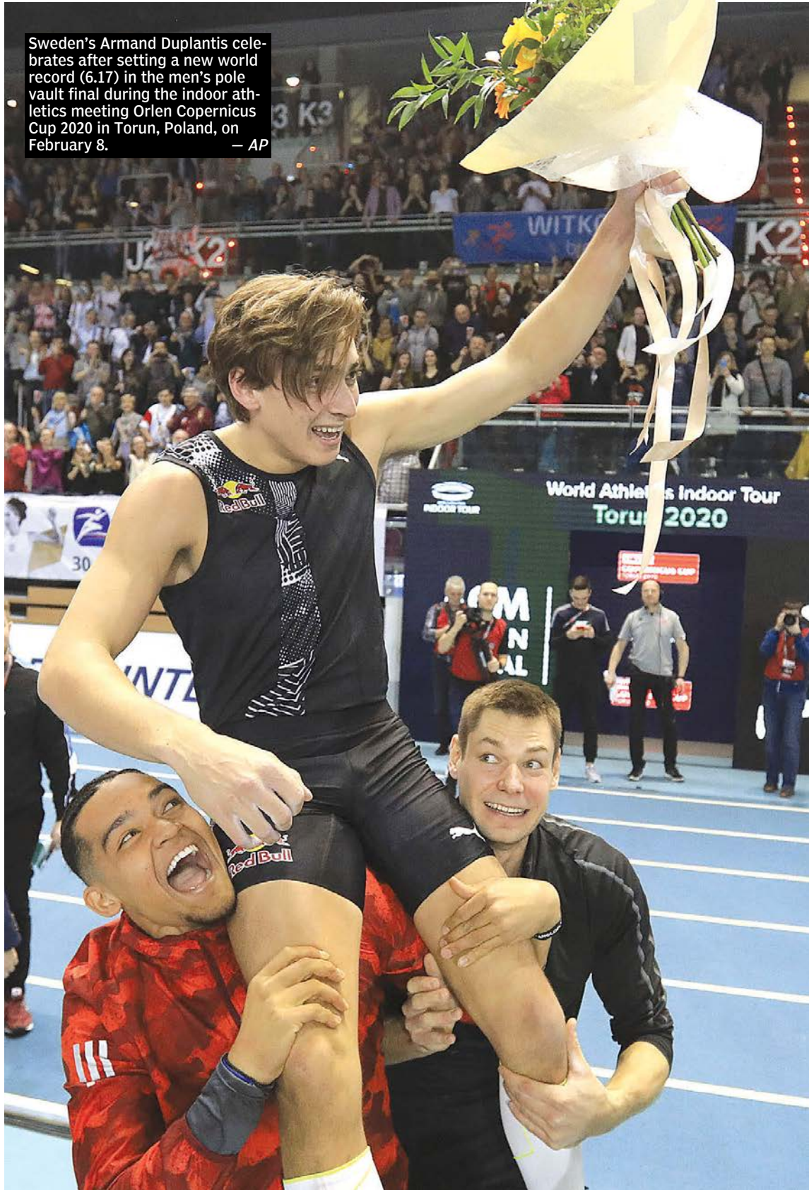
Sweden's Armand Duplantis celebrates after setting a new world record (6.17) in the men's pole vault final during the indoor athletics meeting Orlen Copernicus Cup 2020 in Torun, Poland, on February 8.

■ Duplantis, who announced his prodigious talent to a wider audience when he won the European outdoor title in Berlin in 2018 with a vault of 6.05m, a world junior record, acknowledged that the world record in Torun had not come as a surprise