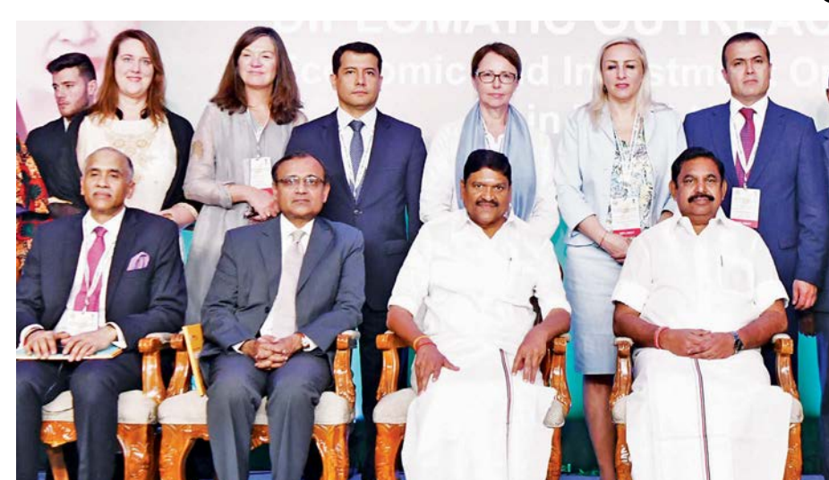
CM Edappadi K. Palaniswami with High Commissioners and ambassadors at a 'Diplomatic Outreach' programme, organised by the external affairs ministry and the state government.

State Chief Minister, Mr. Edappadi K Palaniswami on Friday urged foreign envoys to be "bridge builders" in facilitating more investments from their respective countries into Tamil Nadu, even while exploring possibilities of their respective state development funding agencies to invest in infrastructure development here. "Your good offices should help to cement better ties between us," Mr. Palaniswami said, addressing a group of High Commissioners and Ambassadors at a 'Diplomatic Outreach' programme, organised by the External Affairs Ministry and the State government. Lauding the assistance rendered by officials of various countries during his tri-nation tour last year to attract more FDI (direct foreign investment) to the State, Mr. Palaniswami also sought their cooperation to implement Tamil Nadu's government's 'Yaadum Oore' initiative to reach out to the Tamil Diaspora in various foreign countries and get them engaged economically. Mr. Palaniswami had launched the initiative during his visit to New York last