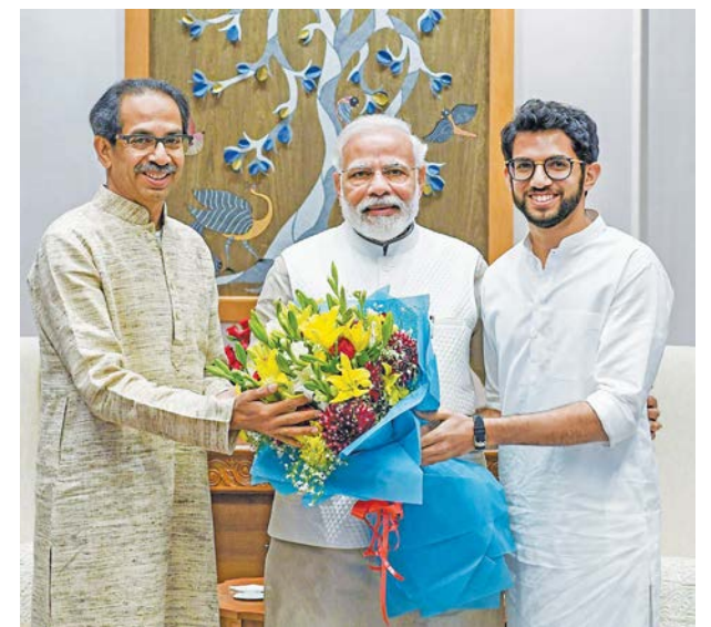
Maharashtra Chief Minister Uddhav Thackeray and his son and state minister Aadiya Thackeray calling on Prime Minister Narendra Modi in New Delhi on Friday.