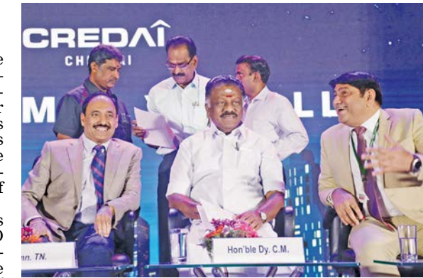
Deputy Chief Minister O. Panneerselvam at FAIRPRO 2020 organised by the Confederation of Real Estate Developers Association of India (Credai) at Chennai on Friday.

The stamp duty rate imposed by the government for buying properties will be reduced after conducting consultations with all stakeholders including officials and the government", O. Panneerselvam, the Deputy Chief Minister, has said. The Deputy CM was inaugurating FAIRPRO 2020 organised by the Confederation of Real Estate Developers Association of India (Credai) at Chennai Trade Centre at Nandambakkam here on Friday. "Last time I met Credai officials, they took up with me the matter of reducing stamp duty for property deals. I had given them an assurance to cut the duty. I will take the matter seriously. The duty will be cut so that our government's goal of 'house for all' can be achieved. Apart from that a single window scheme will be also introduced to ease out the anomalies relating to property deals. The government will pro-