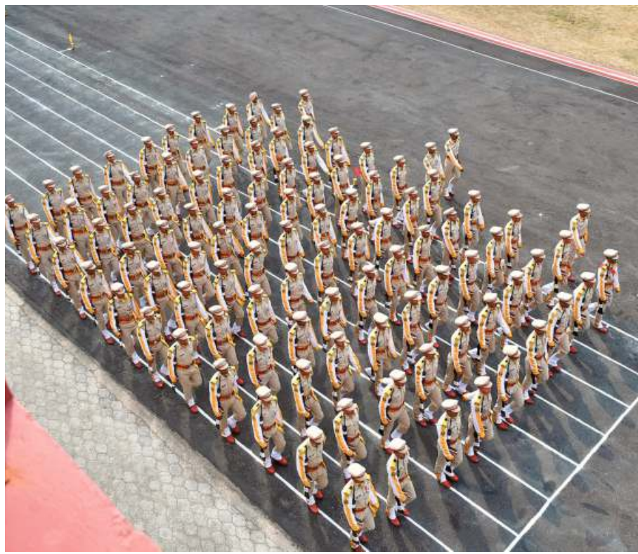
Ready for action: As many as 1,160 personnel, including 84 women, were inducted into the Central Industrial Security Force after a passing out parade held at the Regional Training Centre near Arakkonam in Tamil Nadu on Saturday. *C. VENKATACHALAPATHY (SEE PAGE 9)