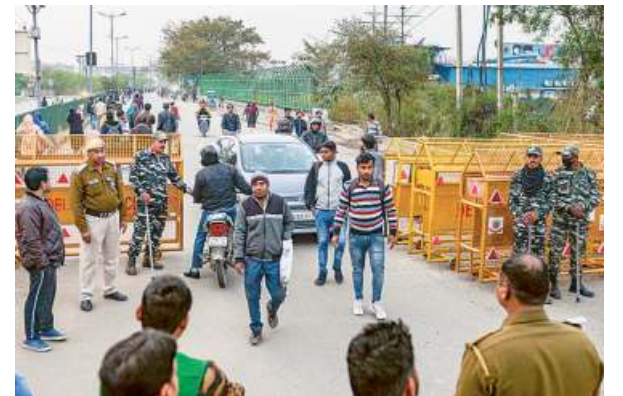
Open again: A stretch of the road that was closed for over two months being cleared on Saturday.

The police said a small stretch was opened by prot-