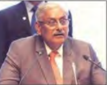
Justice Arun Mishra at the event on Saturday.

JUSTICE ARUN Mishra of the Supreme Court on Saturday described Prime Minister Narendra Modi as a "versatile genius who thinks globally and acts locally". Delivering the vote of thanks at the inaugural ceremony of the International Judicial Conference, 2020 in New Delhi, Justice Mishra said: "India, i.e. Bharat, which is the biggest successful democracy of the world... is a responsible and most friendly member of the international community under the stewardship of internationally acclaimed visionary, Prime Minister Shri Narendra Modi." He added that "India is committed to constitutional obligations and dedicated to a peaceful and secure world, free from terrorism." Justice Mishra said that "in the process of development, preservation of the environment is considered supreme", and that