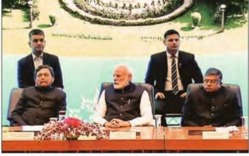
PM Narendra Modi with CJI SA Bobde and Law Minister Ravi Shankar Prasad, in New Delhi on Saturday.