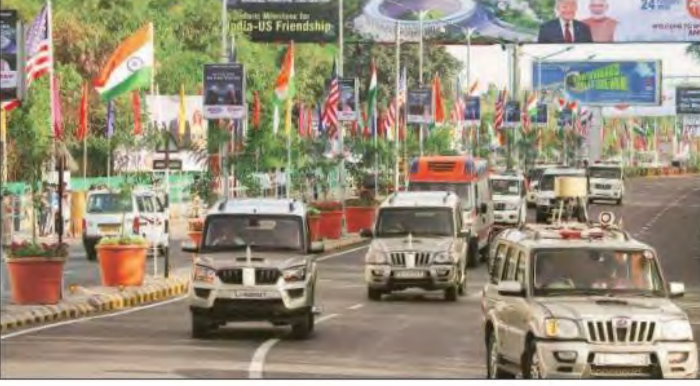
Security personnel conduct a rehearsal ahead of US President Donald Trump's visit, in Ahmedabad on Saturday.