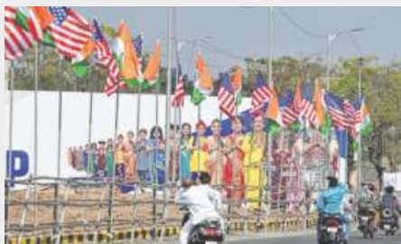
Curtain raiser: Roadside decorations in Ahmedabad on the eve of President Donald Trump's visit.