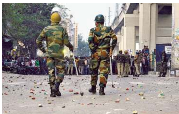
On their toes: Paramilitary personnel standing guard at Maujpur in Delhi on Sunday.

The incident was reported around 1 km from the Jaffarabad metro station, where one side of the carriageway had been blocked by anti-CAA protesters since morning. After slogan shouting from both sides, the groups started pelting each other with stones, leading to chaos