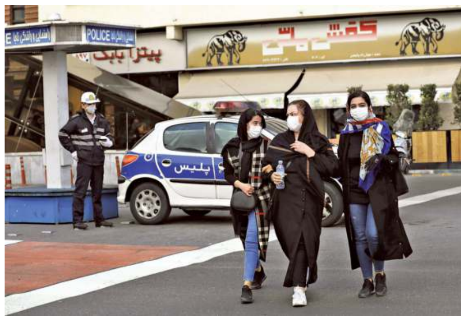
Global score: Women wearing masks in downtown Tehran on Sunday.

Justice delivered: Harvey Weinstein, right, entering New York City Criminal Court on Monday in New York City.