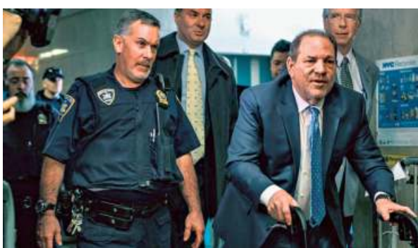
Justice delivered: Harvey Weinstein, right, entering New York City Criminal Court on Monday in New York City.

ASSOCIATED PRESS NEW YORK Harvey Weinstein was convicted on Monday of rape and sexual assault against two women and was immediately handcuffed and led off to jail, sealing his dizzying fall from powerful Hollywood studio boss to arch-villain of the #MeToo movement. Weinstein, 67, had a look of resignation on his face as he heard the verdict that could send him to prison for up to 29 years. "This is the new landscape for survivors of sexual assault in America, I believe, and it is a new day. It is a new day because Harvey Weinstein has finally been held accountable for crimes he committed," Dis-