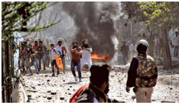
Taking aim: A protester seen with a gun during clashes in Jaffrabad, Delhi, on Monday.