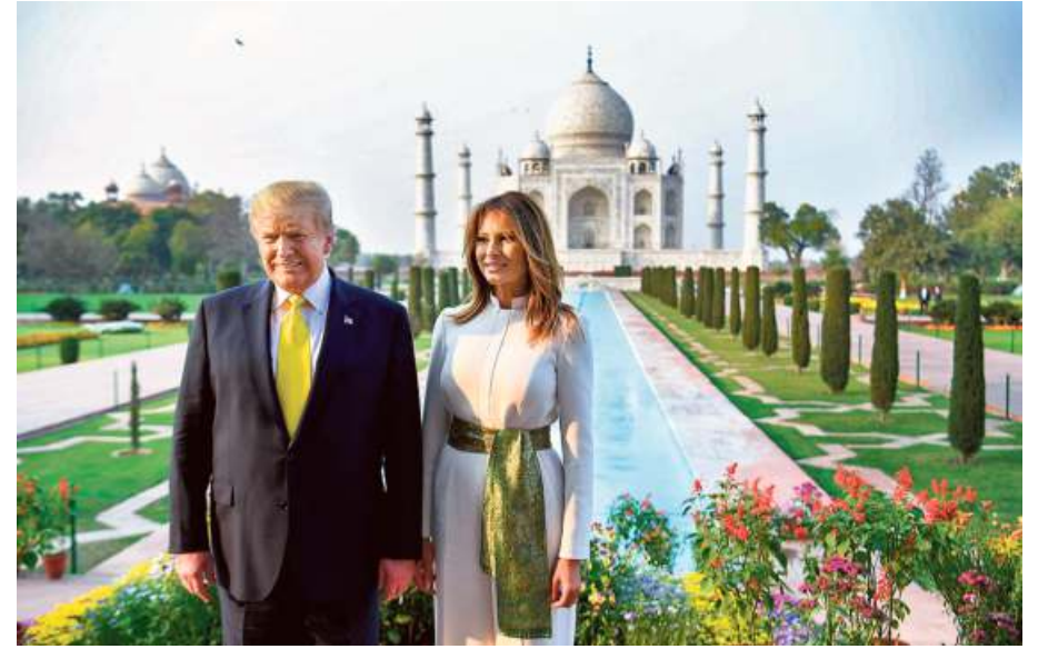
Picture perfect: U.S. President Donald Trump and First Lady Melania posing in front of the Taj Mahal in Agra on Monday.

In his long speech, sprinkled with praise for not only Mr. Modi but also for India's democracy, pluralism and diversity, Mr. Trump highlighted the country's achievements and what its