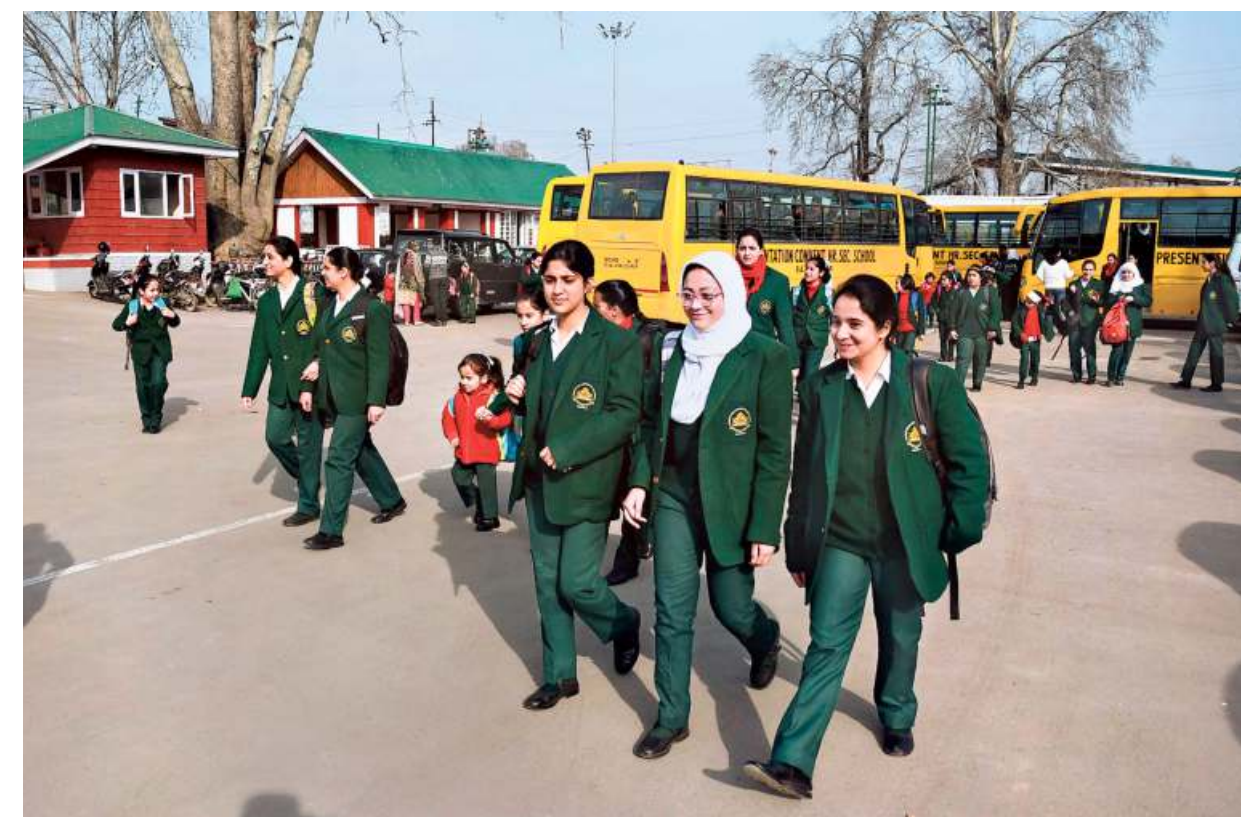
Girls attending school in Srinagar on Monday. Over 10 lakh students of the Valley donned their uniforms for the first time in seven months as schools reopened after a three-month-long winter break that coincided with months of disruption in the wake of withdrawal of the special status of Jammu and Kashmir in August last year.