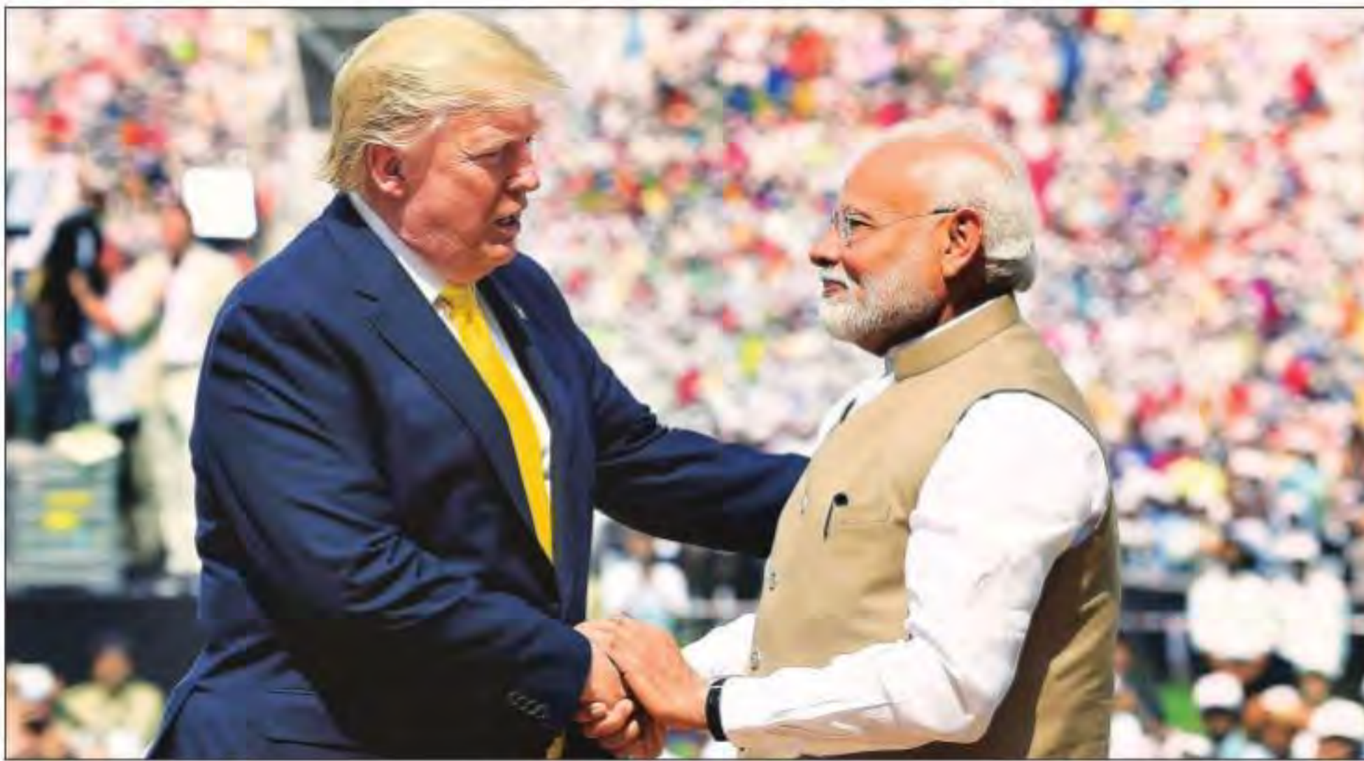
At the Namaste Trump event in Motera stadium in Ahmedabad on Monday.