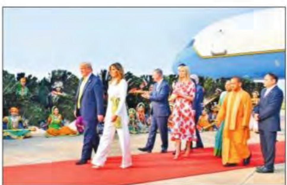
Trump, Melania, his daughter Ivanka and her husband Jared Kushner with UP Governor Anandiben Patel and CM Yogi Adityanath in Agra, Monday.

DEFENCE DEALS with the US is a win-win for both sides. While India is able to diversify its defence acquisition — away from dependence on legacy Russian equipment — the US President can leverage this to create jobs in America. This deal could turn out to be the main takeaway of the visit.