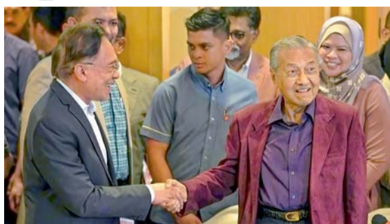
Malaysian Prime Minister Mahathir Mohamad shakes hand with successor Anwar Ibrahim in Putrajaya, Malaysia on Monday.

Kuala Lumpur, Feb. 24: Malaysian Prime Minister Mahathir Mohamad resigned on Monday in a shock move after his political allies sought to form a new coalition in a bid to block the succession of leader-in-waiting Anwar Ibrahim. It followed weekend political drama that saw an attempt by Anwar's rivals within his own "Pact of Hope" coalition — which stormed to a historic election victory in 2018 — and opposition politicians to form a new government. That coalition would reportedly have excluded Anwar, Mahathir's presumptive successor and a former opposition icon who was jailed for years on questionable sodomy charges, blocking his ascent to the premiership.