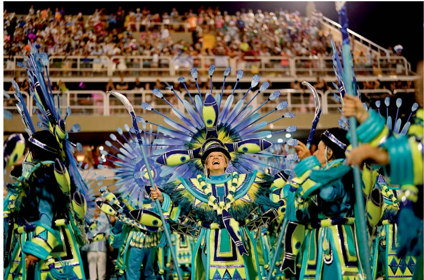
Performers wearing costume from the Portela samba school parade during Carnival celebrations at the Sambadrome in Rio de Janeiro, Brazil on Monday.