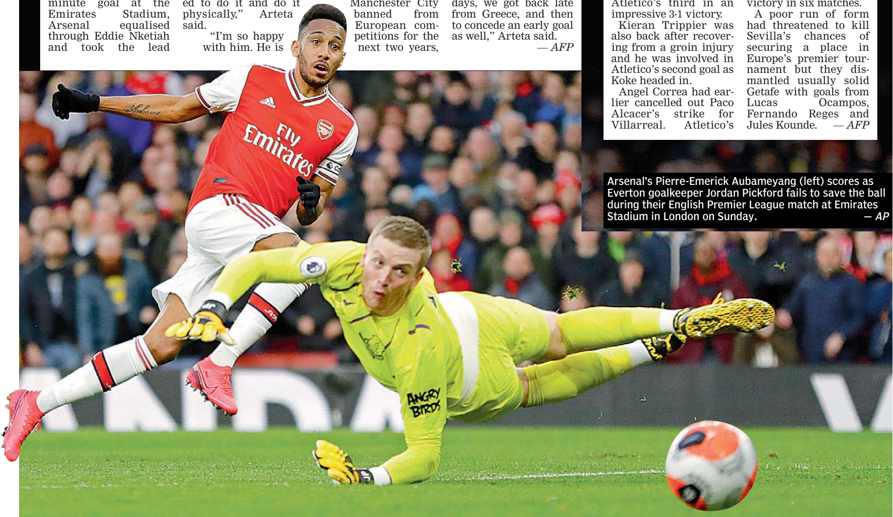
Arsenal's Pierre-Emerick Aubameyang (left) scores as Everton goalkeeper Jordan Pickford fails to save the ball during their English Premier League match at Emirates Stadium in London on Sunday.

A poor run of form had threatened to kill Sevilla's chances of securing a place in Europe's premier tournament but they dismantled usually solid Getafe with goals from Lucas Ocampos, Fernando Reges and Jules Kounde.