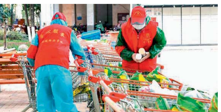
Community staff members sort food and daily necessities as they prepare to deliver to residents in Wuhan of China's central Hubei province.

Beijing, Feb. 24: Authorities in Wuhan on Monday reversed a decision that would have allowed some people to leave the quarantined city. The city government said that the previous announcement had been made by a traffic prevention and control group "without the consent" of the local leadership, and was now "declared invalid". It had earlier announced that people who are not quarantined and seeking special treatment or stranded in the city can leave in batches.