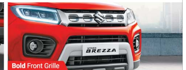
Bold Front Grille