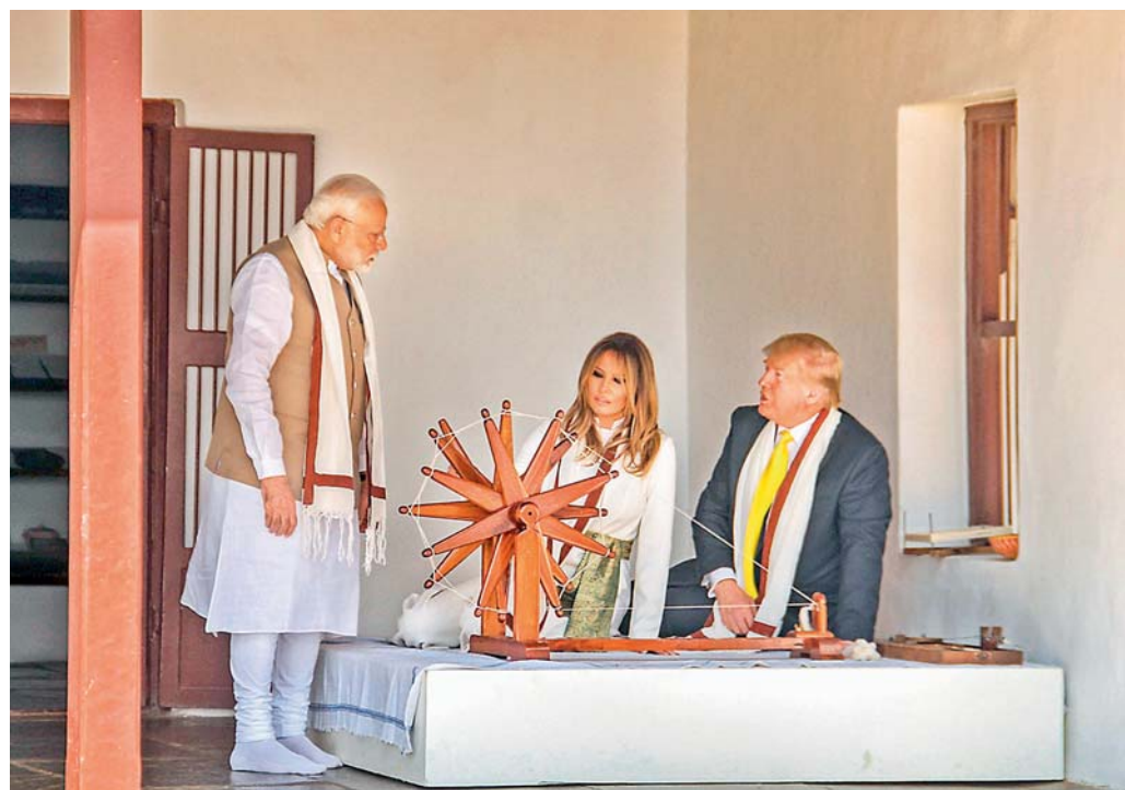
Prime Minister Narendra Modi, US President Donald Trump and First Lady Melania Trump at Sabarmati Ashram in Ahmedabad on Monday. (Right) US President Donald Trump and First Lady Melania Trump observe the 'Three Wise Monkeys' memento presented by Prime Minister Narendra Modi.

When Trump leaves India 36-hours after his arrival, there will be no signs of his visit on the soil of India, the Sena said.