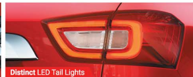
Distinct LED Tail Lights