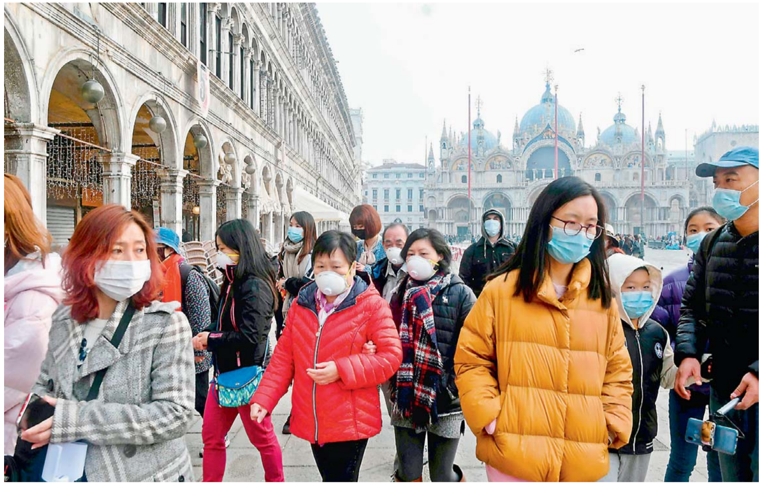
Tourists wearing protective facemasks visit the Piazza San Marco, in Venice, on Monday during the usual period of the Carnival festivities, with the last two days having been cancelled due to outbreak of novel coronavirus. — AFP

sidents were limited to exiting their compound once every three days. Now even that has been taken away. Guo is among some 11 million residents in Wuhan, a city in central Hubei province that has been under effective quarantine since January 23 as Chinese authorities race to contain the virus. Since then, its people have faced a number of tightening controls over daily life. — AFP