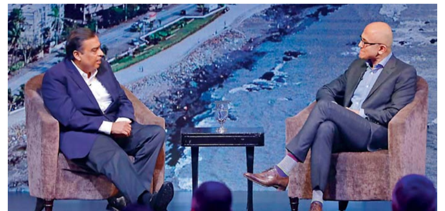
Microsoft CEO Satya Nadella and RIL chairman Mukesh Ambani in a fireside chat in Mumbai on Monday.

When that happens, he wondered: "Will we be the most technologically enabled society? Will we be having all our development enabled by all the tools of technology?"