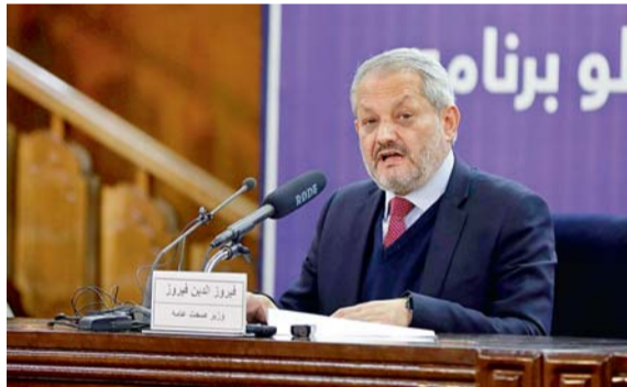
Afghanistan Health Minister Ferozuddin Feroz at a news conference in Kabul, on Monday, after one of three persons suspected of having the coronavirus tested positive in western Herat province.

Kabul, Feb. 24: Afghanistan has detected its first novel Covid-19 case, the country's health minister said on Monday, a day after Kabul announced it would suspend air and ground travel to Iran, where 12 people have died from the outbreak. "I announce the first positive Covid-19 (case) in Herat," health minister Ferozuddin Feroz told a press conference, calling on citizens to avoid travel to the western province which borders Iran. Afghan authorities had earlier announced a suspension of suspend air and ground travel to Iran, as fears mount across the region over a jump in new covid-19 infections. Iran has registered the