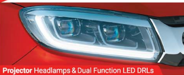
Projector Headlamps & Dual Function LED DRLs