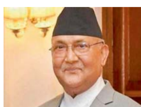
K.P. Sharma Oli

tions of the premier on Sunday at his birthplace in east Nepal's Terhathum district. The cake, with a replica of the country's map drawn on it, was taken in a helicopter from Kathmandu to the venue. In the pictures circulated online, Oli is seen cutting the cake and distributing it to the children present at the occasion, Annapurna Post daily reported. Social media users expressed anger at the use