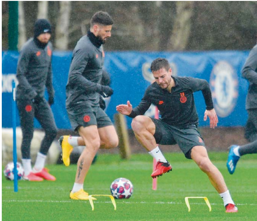
Chelsea's Spanish defender Cesar Azpilicueta takes part in a training session at the club's Cobham training facility in Stoke D'Abernon, southwest of London, on Monday, eve of their UEFA Champions League pre-quarterfinal first leg match against German club Bayern Munich.