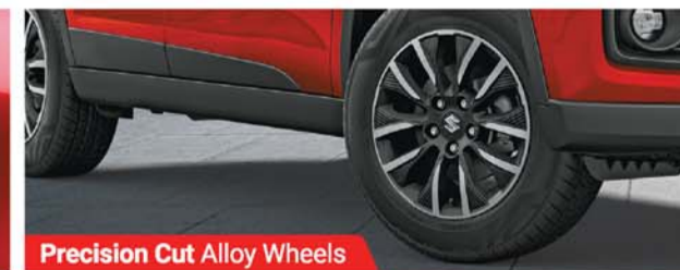
Precision Cut Alloy Wheels