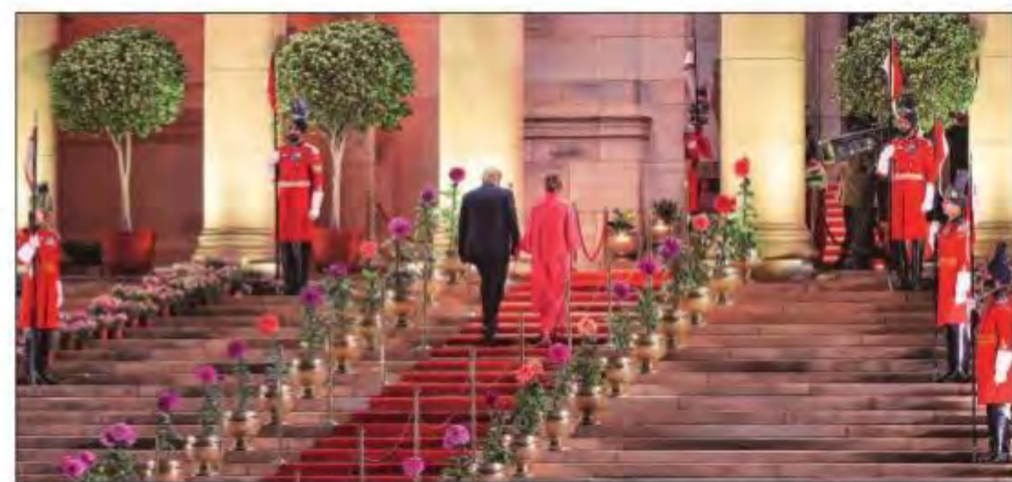
The Trumps at Rashtrapati Bhavan for the banquet hosted by President Ram Nath Kovind.

Defence deal announced, Trump says tremendous progress on trade pact