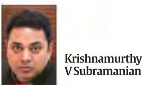
Krishnamurthy V Subramanian

HIGHLIGHTING THE importance of wealth creation through liberalisation of the economy and promotion of private sector, Chief Economic Advisor Krishnamurthy V Subramanian laid out a blueprint for India to chart the path towards achieving the $5 trillion economy target in the Economic Survey 2019-20. While listing the government interventions that have failed to yield results, Subramanian, in the Survey,