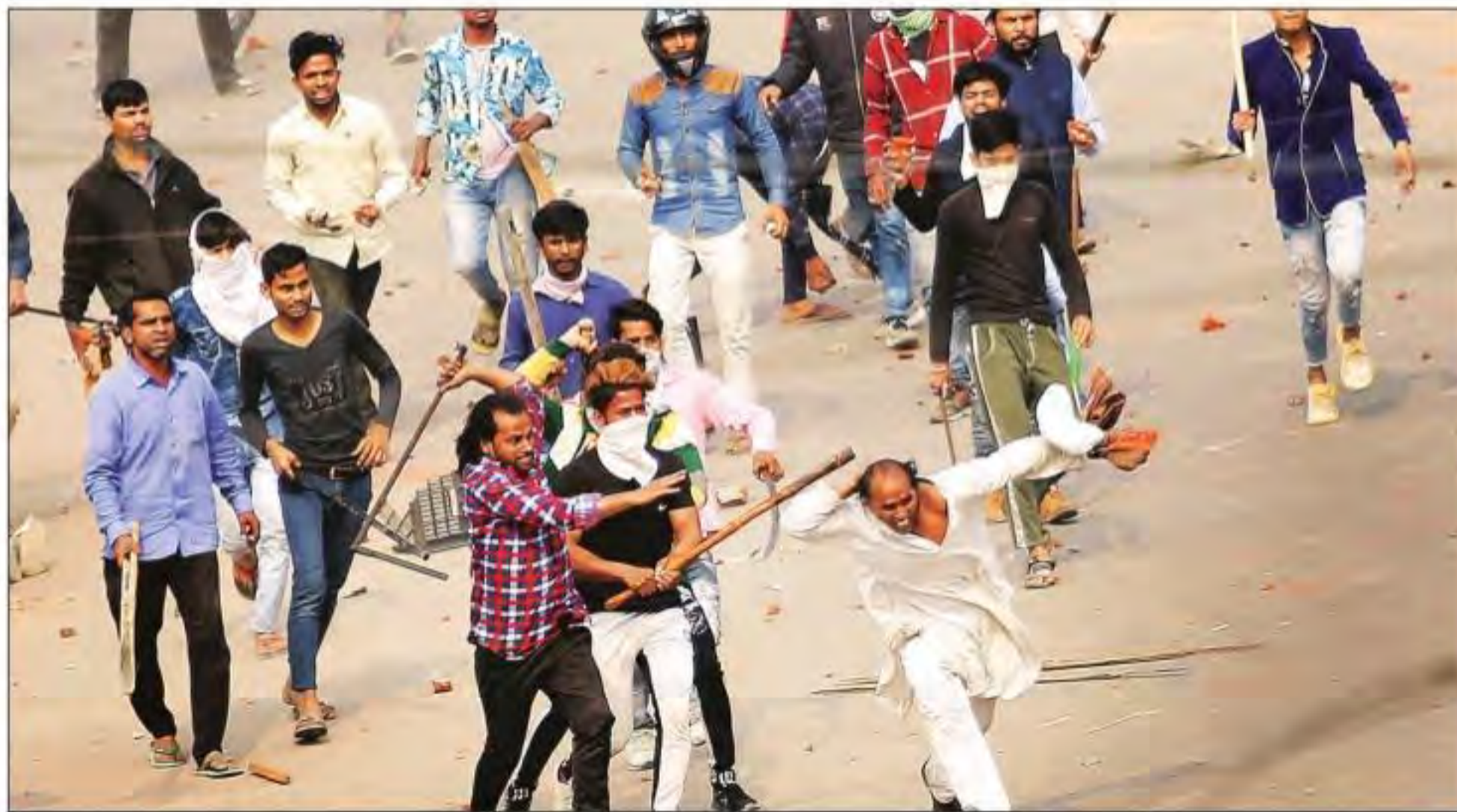
A mob attacks a person at Khajuri Khas crossing in Delhi on Tuesday.

■ At 11.15 am on Chajipur-Kabir Nagar road, six policemen stood by and watched as hundreds of men holding rods and sticks, many with faces hidden behind motorcycle helmets, raised chants of Jai Shri Ram. As the men gathered outside the Sanatan Dharm mandir, one of