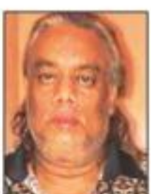
Was arrested in Senegal, extradited

Among the politicians who received extortion calls are