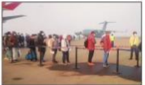
Indians evacuated from Wuhan, at the airport in New Delhi on Thursday.

"We want to leave the country because our parents are re-