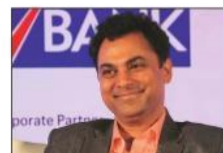
CEA K V Subramanian at the Express Adda.

Speaking at the Express Adda in Mumbai on Wednesday, Subramanian said: "Credit in the public sector like space is starting