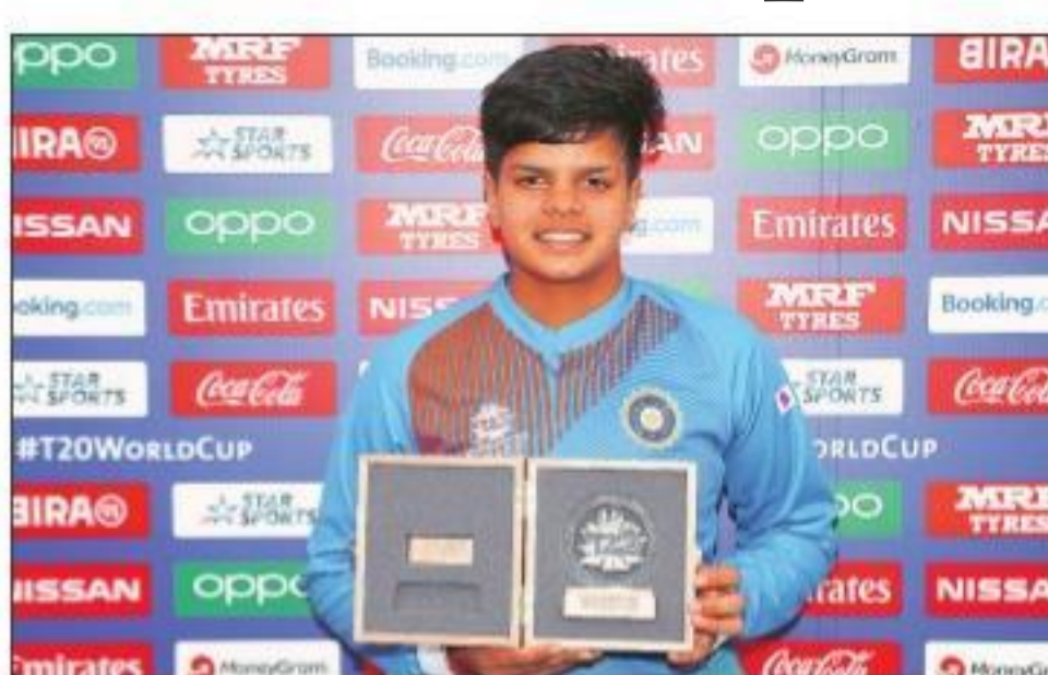
Shafali Verma won her second Player of the Tournament award in Melbourne on Thursday