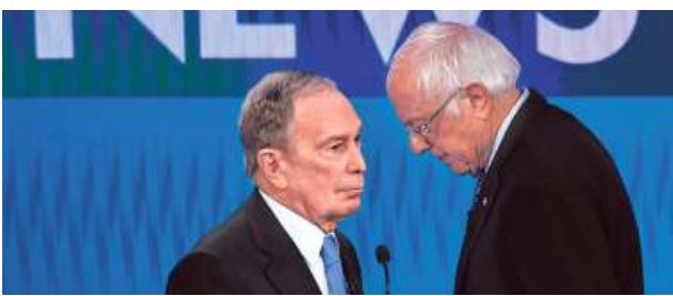
Face to face: Mike Bloomberg and Bernie Sanders.

Should Senator Sanders, the progressive torchbearer and current Democratic frontrunner, or centrist billionaire Bloomberg, who is polling in third, win the nomination and then the election against incumbent Donald Trump, America would have the first Jewish President in its history.