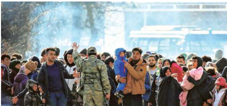
In search of safety: A group of migrants waiting on no-man's land at Turkey's Pazarkule border crossing with Greece's Kastanies on Friday.

U.S. President Donald Trump, in a telephone conversation with Turkish President Tayyip Erdogan, condemned Thursday's attack on Turkish troops and reaffirmed U.S. support for Ankara's efforts to avert a humanitarian disaster in Syria, a White House spokesman said. The two leaders also said Syria and Russia must halt their offences in north-