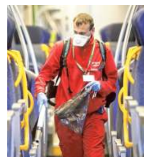
A cleaner sanitising a train wagon in Milan, Italy.

The virus has now infected 83,000 globally, with cases being confirmed in around 50 countries. More