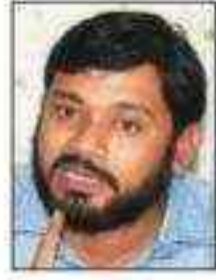
Kanhaiya calls for speedy trial

SEVEN MONTHS after its standing counsel advised against prosecution sanction to Delhi Police in the 2016 JNU sedition case against former JNUSU president Kanhaiya Kumar and nine others, the Arvind Kejriwal-led AAP government has given police the go-ahead.