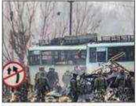
He tracked CRPF convoy, drove car till near site: NIA