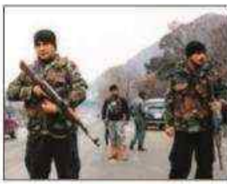
Afghan policemen keep watch in Kabul, Friday.