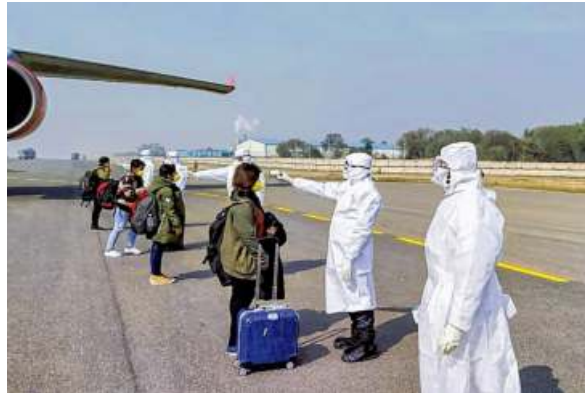
Stringent checks: Indian nationals being screened at the Delhi airport on Sunday on their arrival from Wuhan.

Health Minister K.K. Shylla said, "One more confirmed case of nCoV has been reported in the State. The patient is stable. At present, there are four people, including the affected person, in the isolated ward at the Government Medical College Hospital. Of them, three have been returned recently from Wuhan. The other suspected case is a relative of one of them. We are awaiting the test reports of other suspected cases. A majority of those in observation