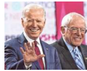
Joe Biden, left, and Bernie Sanders after a debate in Los Angeles.

A crucial and closely followed (including by candidates) final poll on Saturday night from CNN/Des Moines Register/Mediacom, which might have lent more clarity to this crowded race, was