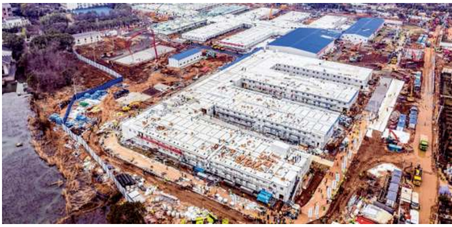
Miraculous effort: An aerial view of Huoshenshan hospital in Wuhan on Sunday as it nears completion 10 days after its construction began. The facility is set to open on Monday.

At least another 171 cases have been reported in more than two dozen other countries and regions, including the U.S., Japan, Thailand, Hong Kong and Britain.