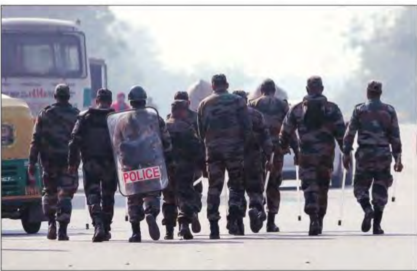
A day after incident of firing, heavy police presence in Shaheen Bagh, Sunday.

THE CITY DELHI GANGRAPE: IN DEATH PLEA, CENTRE CITES HYDERABAD ENCOUNTER NITISH ON DAIS, SHAH CONTINUES ATTACK ON CAA PROTESTS PAGES 3, 5