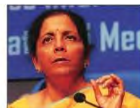
'Some taxpayers will be much better off'

"If you have a flat tax rate, it becomes inequitable in the way that you are taxing the rich and poor... Having a few tax slabs also