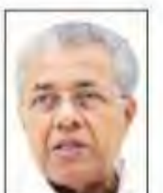
Kerala CM wrote to Centre expressing concern

The government has also proposed to reduce the number of days for individuals to be considered as Indian residents for