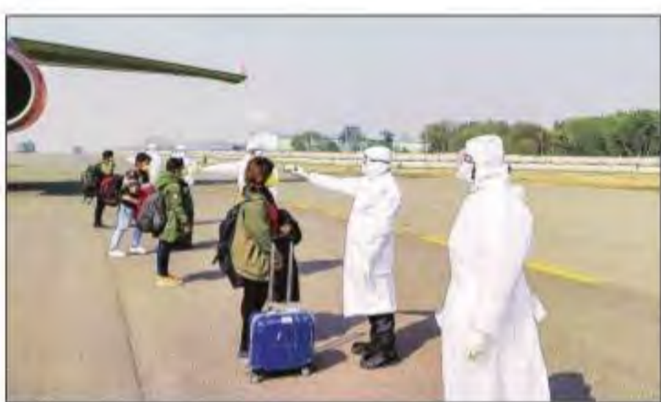
Passengers evacuated by Air India from Wuhan, China, being screened at Delhi airport. 323 were airlifted Sunday.