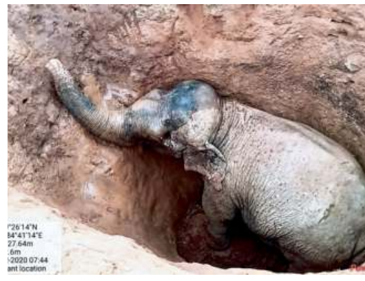
Down in the dumps: The sub-adult female elephant had strayed away from a 14-member herd.