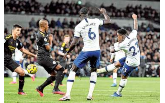
Turn and shoot: Spurs' new signing Steven Bergwijn had a dream debut with this strike against City.

Sergio Aguerro was unusually profligate, striking the post in the first half and