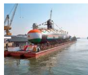
Karanj at a shipyard in Mumbai.