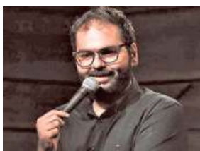
Comedian Kunal Kamra tweeted 'Collateral damage' after hearing of the incident.