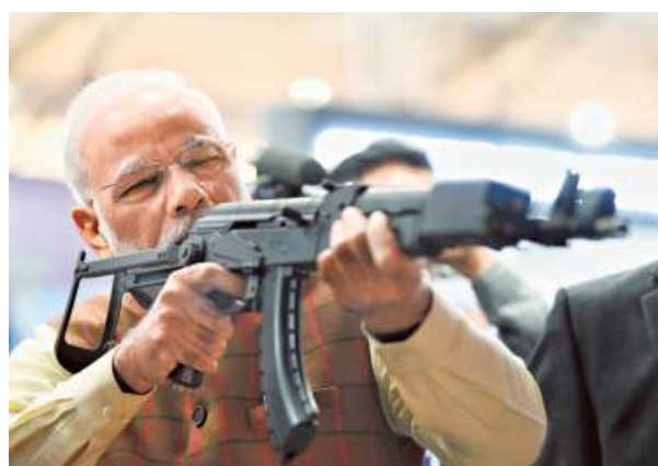
On target: Prime Minister Narendra Modi holding a rifle during a visit to the DefExpo at Lucknow.

Mr. Modi talked about India turning into a manufacturing hub for military platforms and noted that