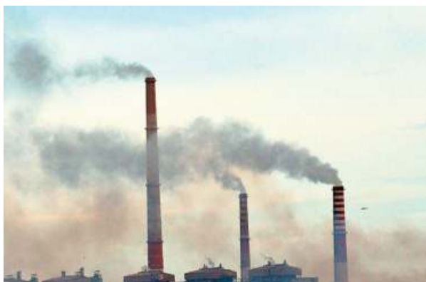
Air score: Coal-fired plants have been directed to put in place pollution control measures by December 2022. •FILE PHOTO

To limit particulate matter (PM), sulphur dioxide and nitrous oxide emission from thermal plants, India put in place a phased-approach that directs 440 coal-fired units - responsible for about 166,000 MW of power - to put in place measures to limit pollution by December 2022.