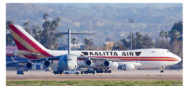
In this file photo an airplane carrying US citizens from Wuhan, China, lands at March Air Reserve Base in Riverside, California.

Washington, Feb. 5: The United States evacuated more than 300 more people on two new flights out of Wuhan, China, the epicentre of the fast-spreading new coronavirus, the State Department said. The two flights left Wuhan on Tuesday US time after the passengers were screened, a State Department official said on Tuesday. The official said that the United States has now brought home more than 500 passengers on three flights. A first flight, with 195 Americans on board, left Wuhan last week and landed in California. The United States is preparing one or two additional planes to evacuate Americans on Thursday, after which it does not intend further flights, the official said. The United States has been placing passengers under mandatory quarantine, the first time that the federal gov-