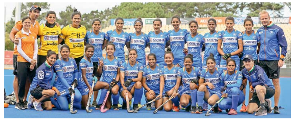
Members of the Indian women's hockey team pose after beating New Zealand 3-0.