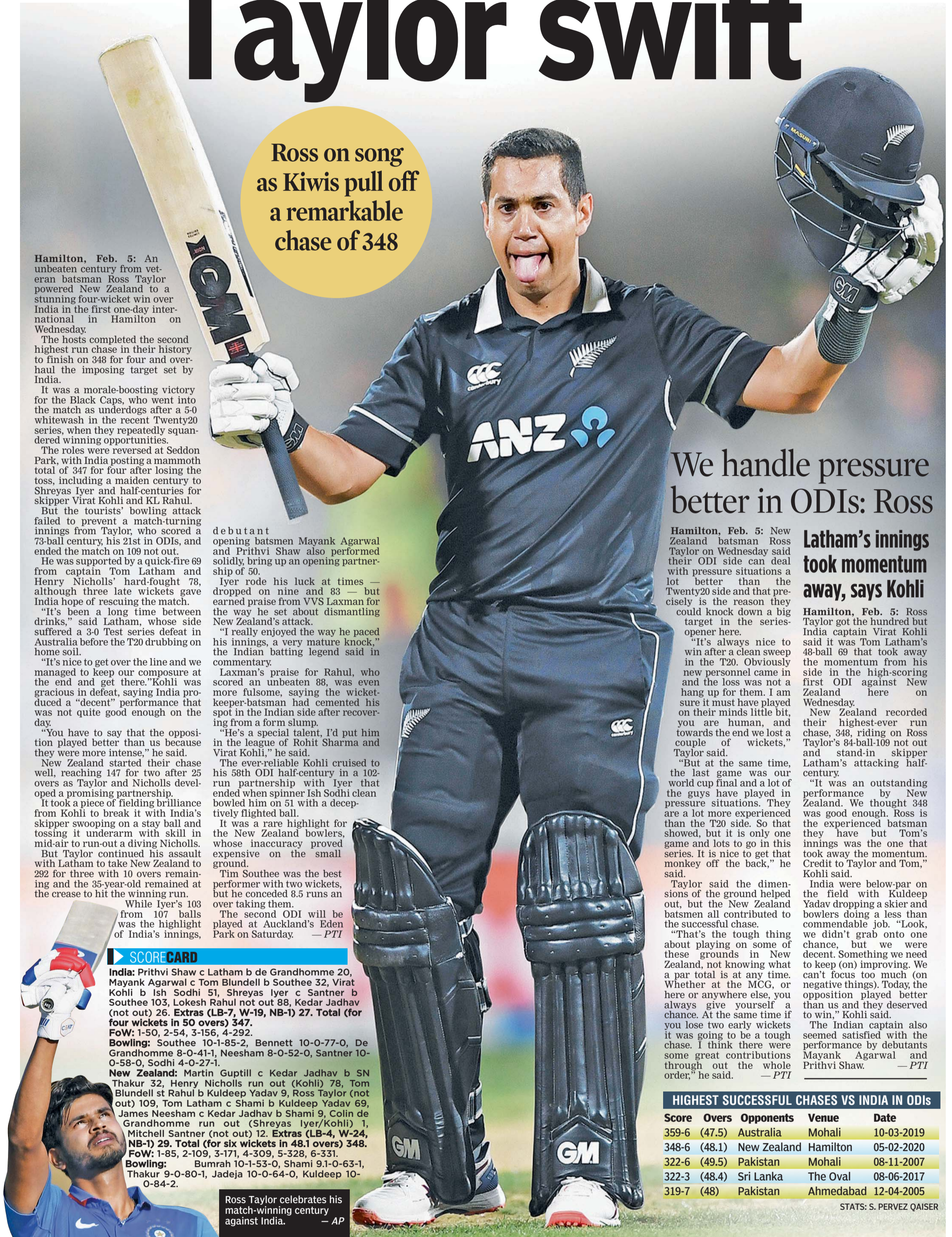
Ross Taylor celebrates his match-winning century against India.

FoW: 1-85, 2-109, 3-171, 4-309, 5-328, 6-331. Bowling: Bumrah 10-1-53-0, Shami 9-1-0-63-1, Thakur 9-0-80-1, Jadeja 10-0-64-0, Kuldeep 10-0-84-2.