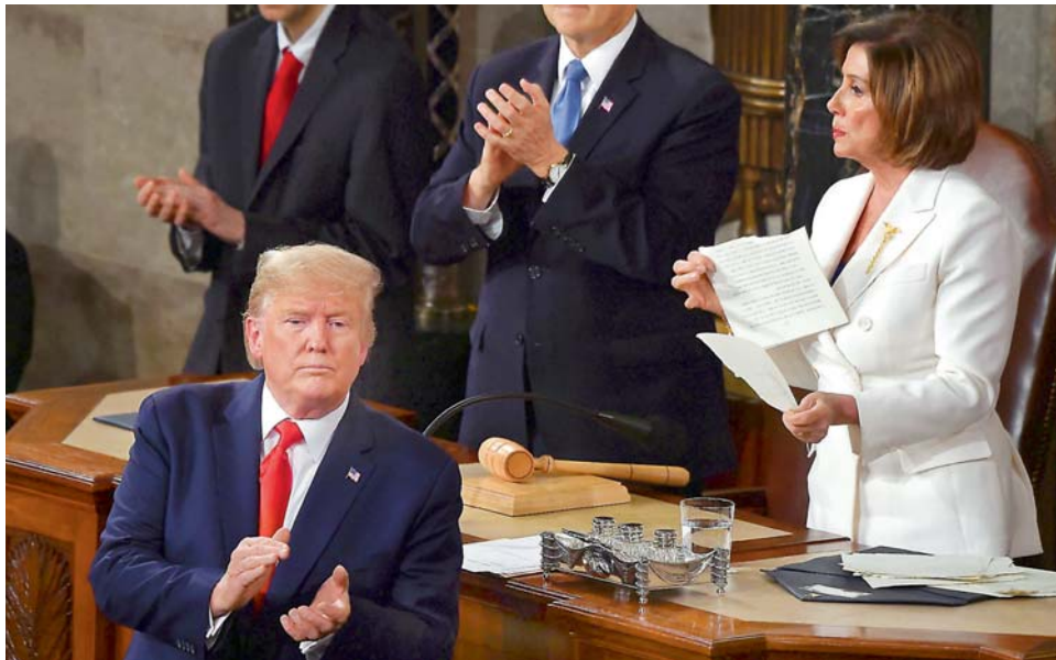
Speaker of the US House of Representatives Nancy Pelosi rips a copy of US President Donald Trump's speech after he delivered the State of the Union address at the US Capitol in Washington, DC, on Wednesday.

Democrats responded to Trump's speech, where he proclaimed a "great American comeback" and touted his achievements, by refusing to follow Republicans in repeated standing ovations. There was boing and several