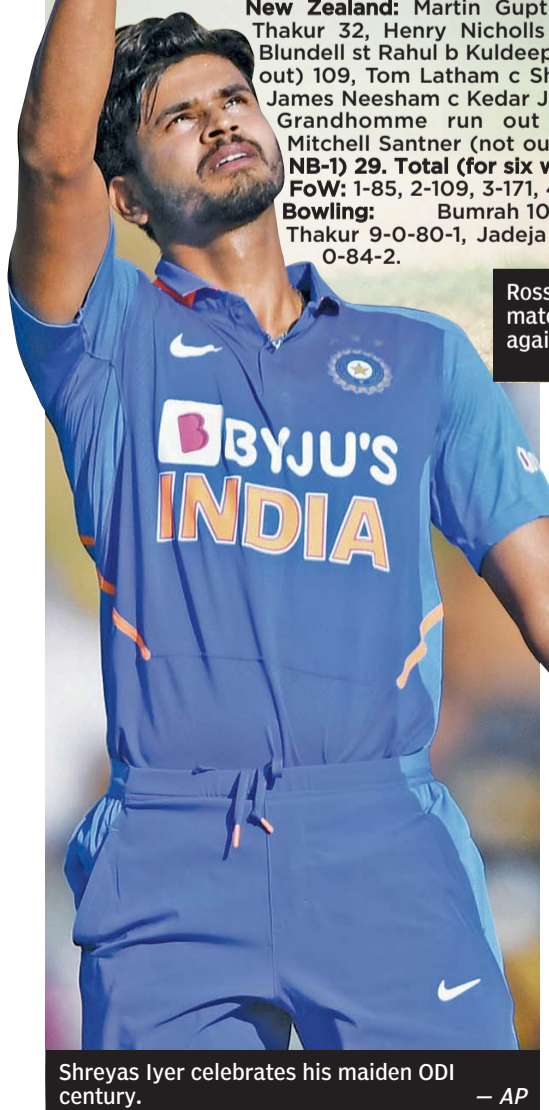
Shreyas Iyer celebrates his maiden ODI century.