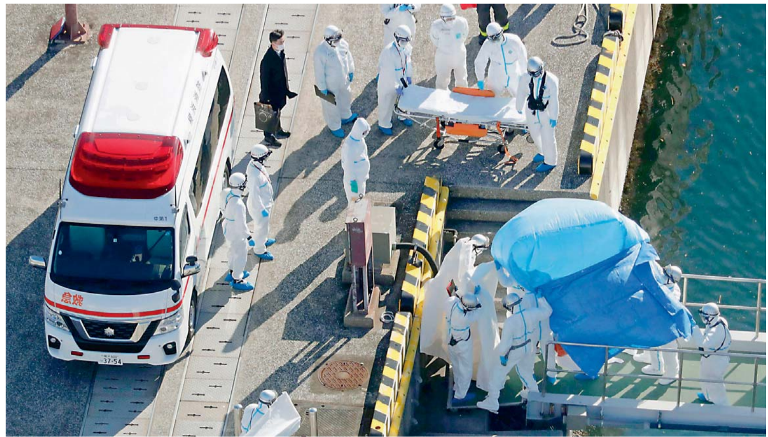
Medical workers in protective suits lead a passenger who tested positive for coronavirus from the cruise ship Diamond Princess at Yokohama Port, south of Tokyo, on Wednesday

The president underlined that his administration has launched ambitious new initiatives to substantially improve care for Americans with kidney disease, Alzheimer's, and those struggling with mental health challenges. Trump said a good life for American families also requires the most affordable, innovative and high-quality healthcare system. "Before I took office, health insurance premiums had more than doubled in just five years. I moved quickly to provide affordable alternatives. Our new plans are up to 60 per cent less expensive. "I have also made an ironclad pledge to American families: We will always protect patients with pre-