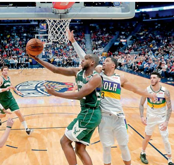
Khrist Middleton (left) of Milwaukee Bucks goes to the basket against Josh Hart (second from right) of New Orleans Pelicans in their NBA game in New Orleans on Tuesday. The Bucks won 120-108.

Brandon Ingram led the host Pelicans with 32 points, while 19-year-old rookie star Zion Williamson had 20 points despite 5-of-19 shooting from the floor with seven