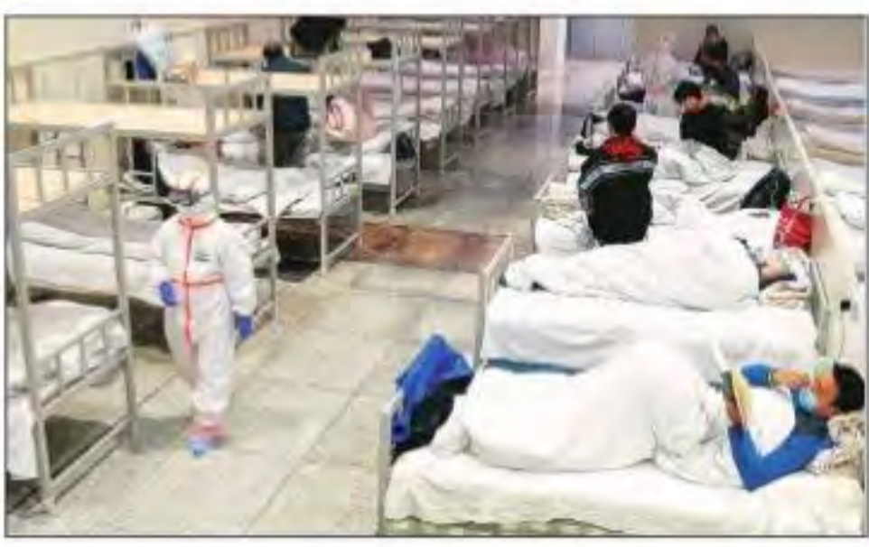
At the Wuhan International Conference and Exhibition Center, which has been converted into a makeshift hospital, on Thursday.

he surrendered to the Pakistani security agencies on February 5, 2017, under an agreement, but that the forces failed to keep their promise.