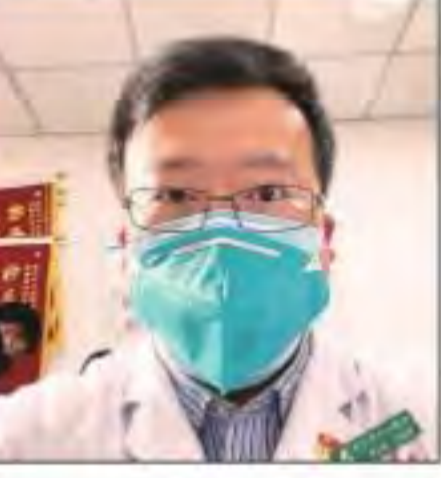
Doctor Li Wenliang

Li explained that, according to a test he had seen, the illness was a coronavirus — a large family of