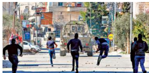
On the boil: Palestinians clashing with Israeli security forces in the Bethlehem area on Thursday.

Tensions have soared following last week's release of President Donald Trump's West Asia initiative, which greatly favours Israel and was rejected by the Palestinians. The violence put the plan on even shakier ground and raised fears of another extended round of fighting.