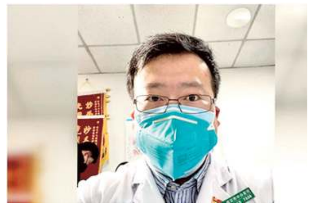
Whistleblower: Doctor Li Wenliang, who first warned about the coronavirus, at a hospital in Wuhan.

At least 20 people on board an ocean liner off the