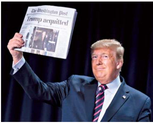
All smiles: Donald Trump holding up a copy of Washington Post with the headline "Trump Acquitted" in Washington.

Romney's dissent vote Republican Senator Romney, who lost his presidential bid to Obama in 2012, voted with 47 Democrats in the Senate against Mr. Trump on abuse of office charge. Senators voted 52 to 48 to acquit Mr. Trump on the charge. They voted 53-47 as per party lines