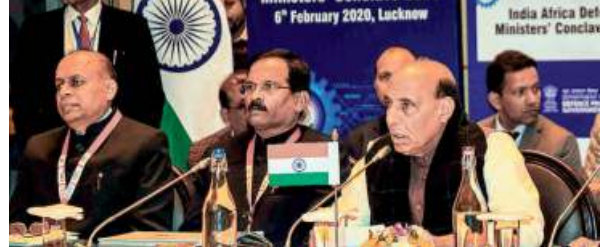
Strong ties: Defence Minister Rajnath Singh speaking during the first India-Africa Defence Ministers' Conclave.

SPECIAL CORRESPONDENT LUCKNOW India and several African countries on Thursday pledged to deepen cooperation to combat the growing threat of terrorism and preserve maritime security by sharing information, intelligence and surveillance, in a joint declaration adopted at the first India-Africa Defence Ministers' Conclave at the ongoing Defexpo. Defence Minister Rajnath Singh said India was geared to provide a range of military hardware to Africa. "We condemn, in the strongest terms, the growing