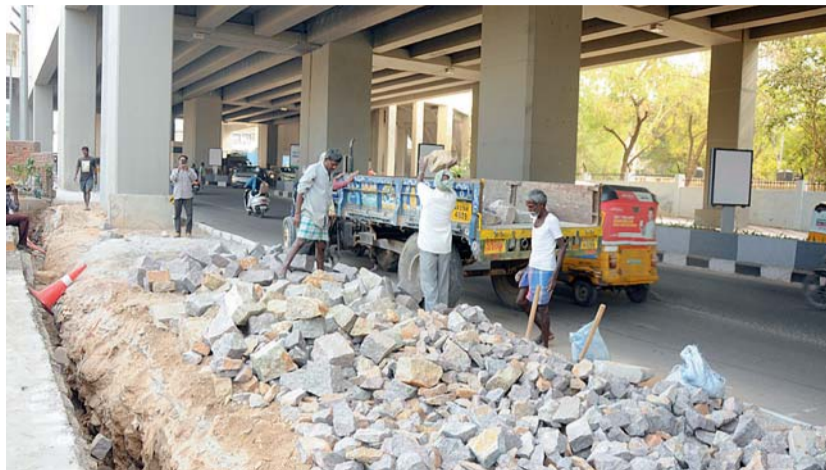
Workers speed up works ahead of the inauguration of Metro Rail station at Jubilee Bus station on Thursday.

The Red Line of the Metro between LB Nagar and Miyapur covers 29 km, and the Blue Line between Nagole and Raidurg covers a similar distance.