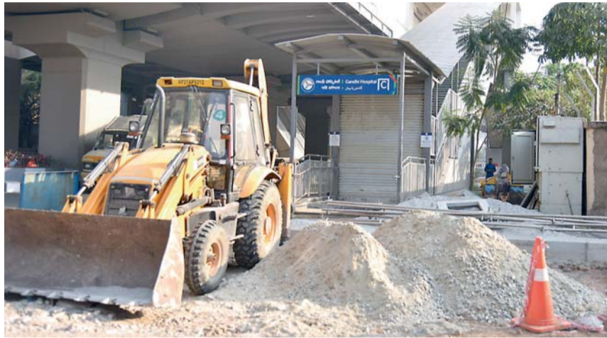
Works under progress at the Metro Rail station near Gandhi Hospital.