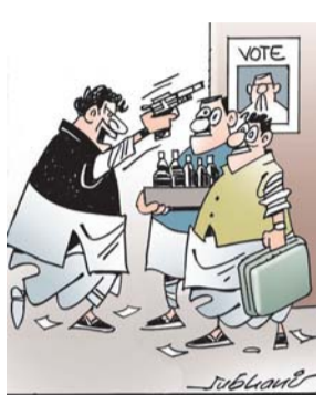
No cash, no liquor... bullets will do!