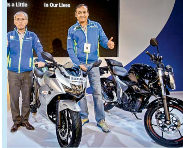
Two men standing next to a Suzuki motorcycle.