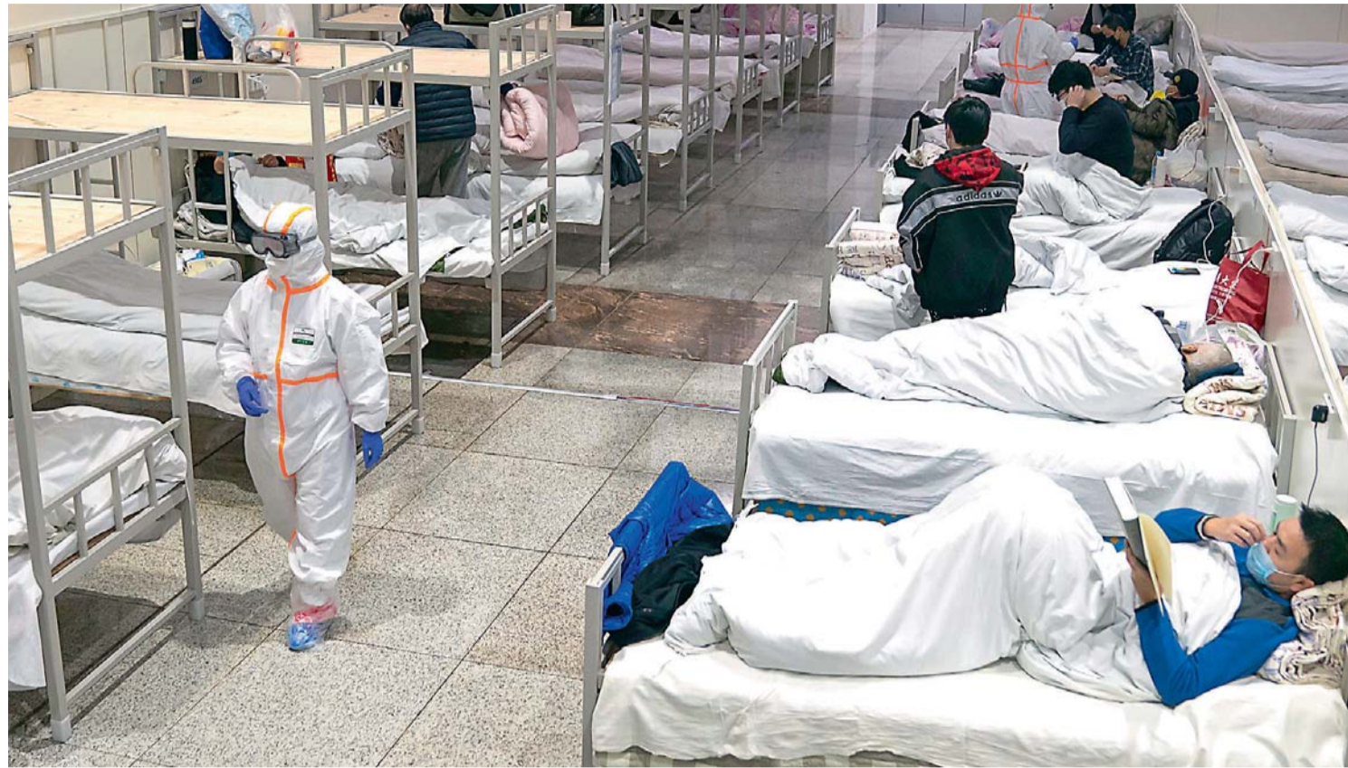
A medical worker in a protective suit walks by as patients diagnosed with the coronavirus, at a temporary hospital that was transformed from an exhibition centre in Wuhan of central China's Hubei province.