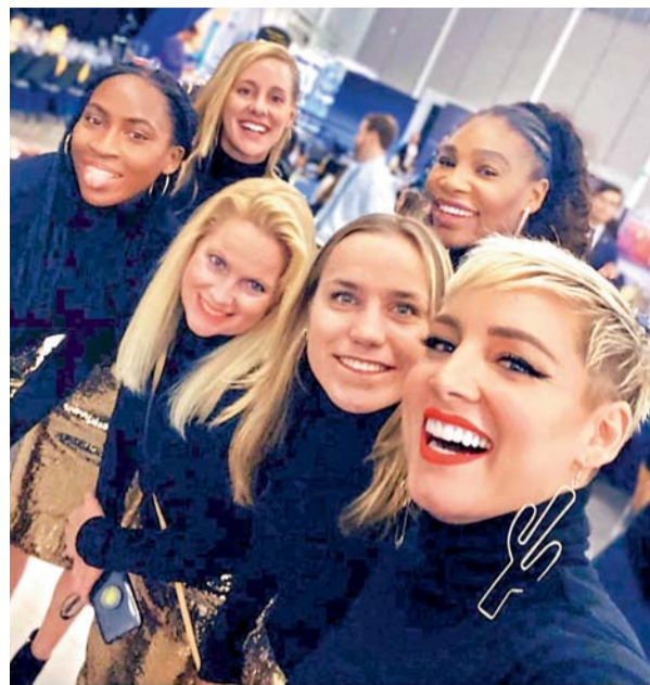
The American Fed Cup team comprising Coco Gauff (clockwise from left), Alison Riske, Serena Williams, Bethanie Mattek-Sands and Sofia Kenin pose for a photograph on Thursday.