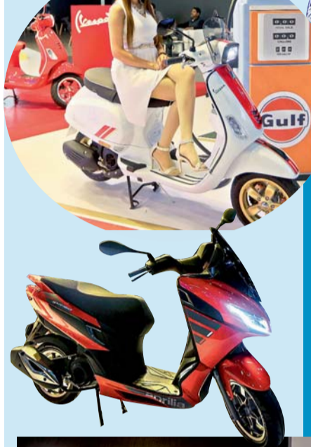
A model poses for photographs with the newly launched Piaggio SXR 160 two-wheeler and the Vespa refresh at the Auto Expo 2020, in Greater Noida on Thursday