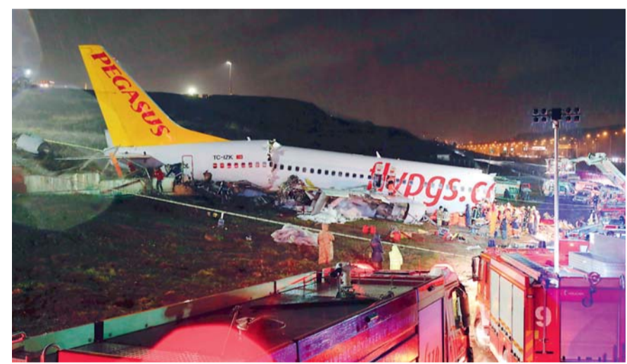
Rescue members and firefighters at the wreckage of a plane after it skidded off the runway at Istanbul's Sabiha Gokcen Airport. — AP

Rescue efforts continued despite adverse weather conditions that caused transport problems. Authorities have banned civilian access to the scene, DHA reported. Last month, the eastern province of Elazig was hit by a powerful 6.7-magnitude earthquake that killed 41 people and injured more than 1,600 others. A 2009 avalanche in the northeastern province of Gumushane killed 11 climbers in the Zigana mountains. — AFP