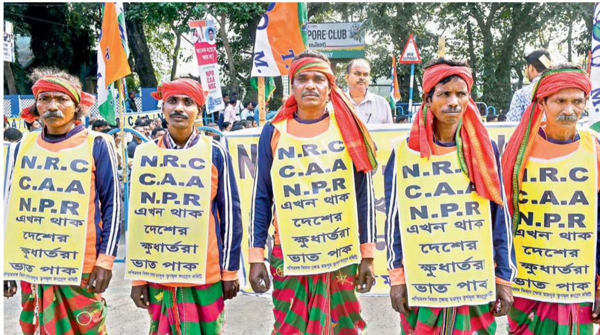
Members of a tribal community stage a demonstration during a dharna staged by the Trinamul against the NRC and the CAA in Kolkata, on Thursday.

Responding to Congress leader Shashi Tharoor, Mr Modi suggested that Tharoor should have some soft corner for Kashmir as he was "son-in-law" of the region, referring to his late wife Sunanda Pushkar.