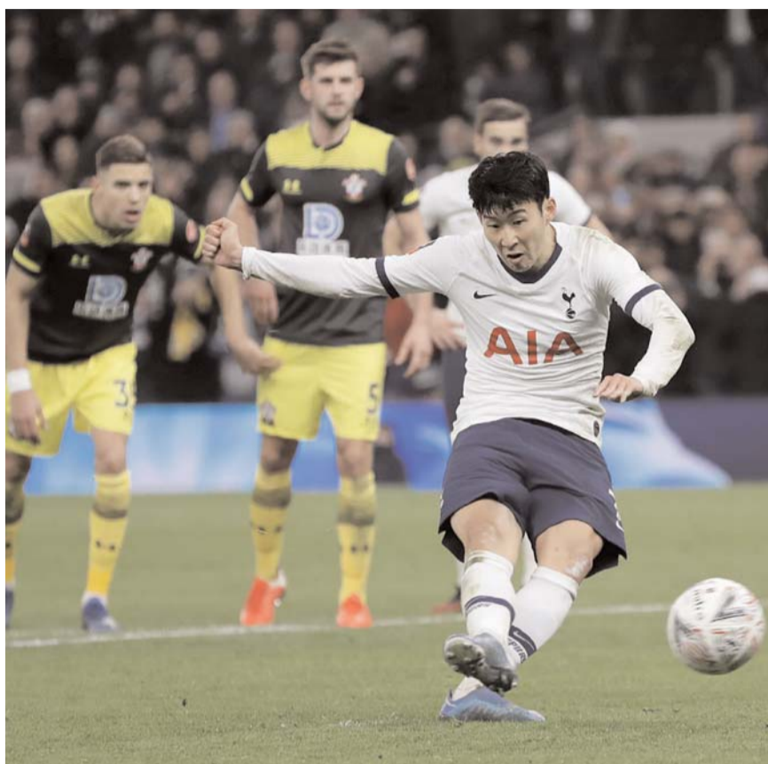
Tottenham's Son Heung-min scores his side's third goal from the penalty spot during their English FA Cup fourth round replay match against Southampton at the Tottenham Hotspur Stadium in London on Wednesday. Tottenham won 3-2.

Southampton's James Ward-Prowse was carried off five minutes before halftime.