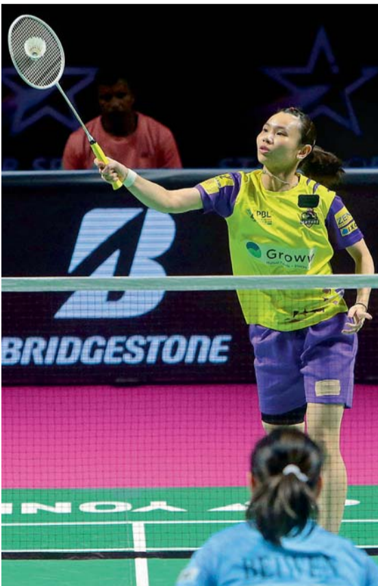
Tai Tzu Ying of Bengaluru Raptors in action during her women's singles match against Beiwen Zhang of the Awadhe Warriors in Hyderabad on Thursday.

The face-off between the former World No.1 Tai Tzu Ying and World No.14 Beiwen Zhang was obviously the cynosure of all eyes. Zhang trails the