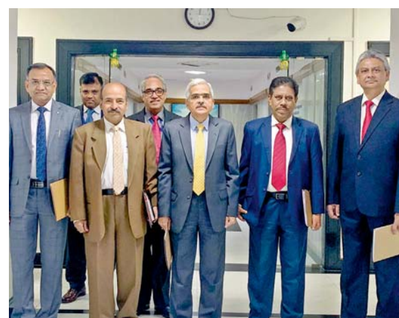
Reserve Bank of India (RBI) Governor Shaktikanta Das, flanked by his deputies, arrives for RBI's sixth bi-monthly monetary policy review meeting of 2019-2020, in Mumbai on Thursday