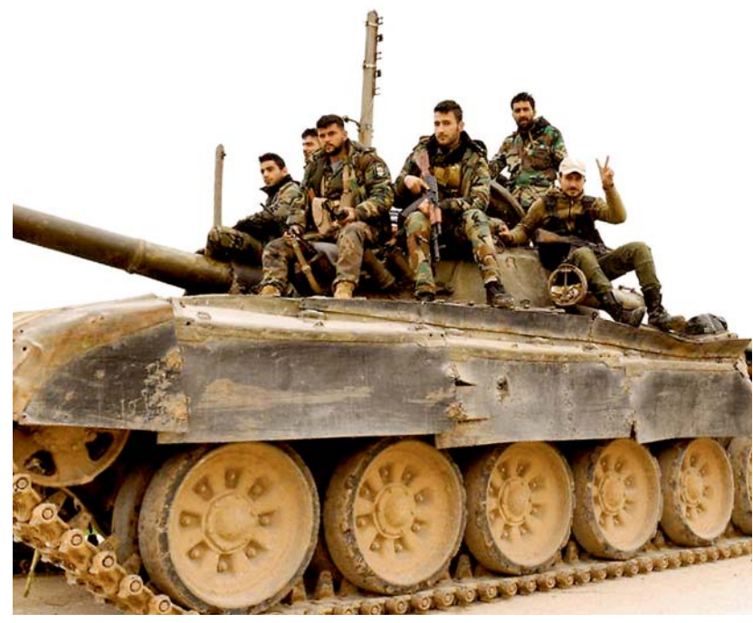
Syrian government forces enter the village of Tel-Toukan in Idlib province, northwest Syria, on Thursday. — AP

ers, during which several Turkish observation posts were surrounded. Later Wednesday, the Observatory reported clashes inside the town between Syrian troops and opposition fighters. Turkish troops stationed north of Saraqeb shelled Syrian troops north and west of the town in efforts to break their hold on the town, the Observatory said. — AP