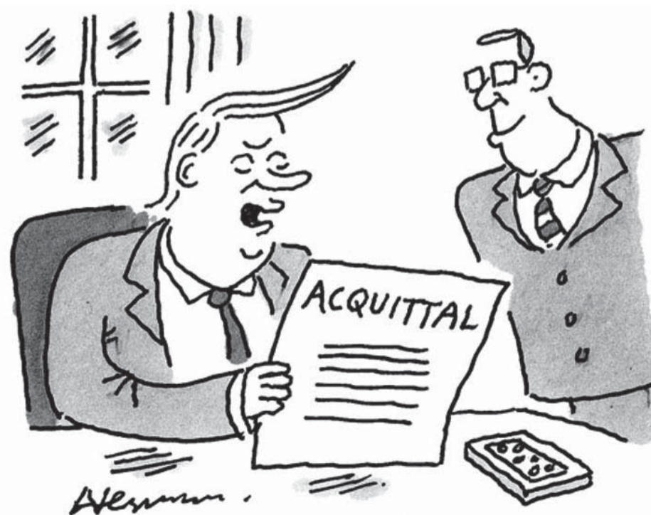
'It's the land of the scot free.'