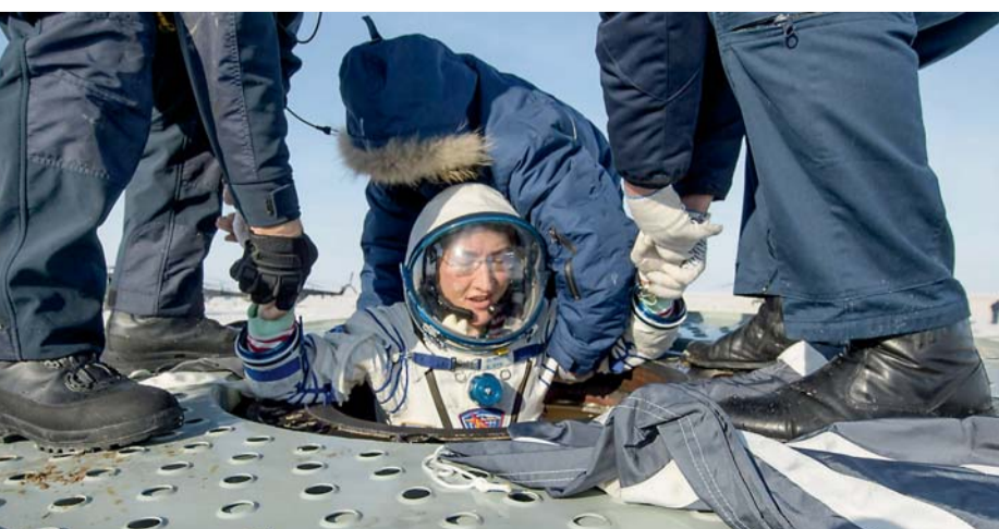
NASA astronaut Christina Koch is helped out of the Russian Soyuz MS-13 space capsule about 150 km south-east of Zhezkazgan, Kazakhstan, on Thursday.

Almaty (Kazakhstan), Feb. 6: NASA's Christina Koch returned to Earth safely on Thursday after shattering the spaceflight record for female astronauts with a stay of almost 11 months aboard the International Space Station. Koch touched down at 0912 GMT on the Kazakh steppe after 328 days in space, along with Luca Parmitano of the European Space Agency and Alexander Skvortsov of the Russian space agency. Koch was shown seated and smiling broadly after being extracted from the Soyuz descent module in the Roscosmos space agency's video footage from the landing site. "I am so overwhelmed and happy right now," said