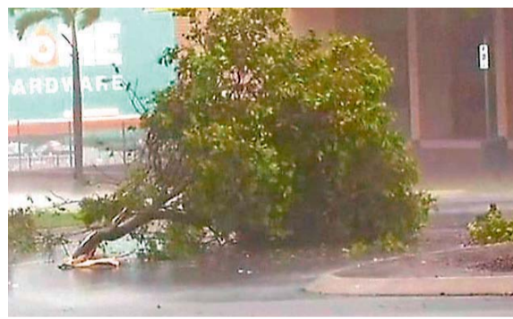
A powerful cyclone batters the Australian coast.