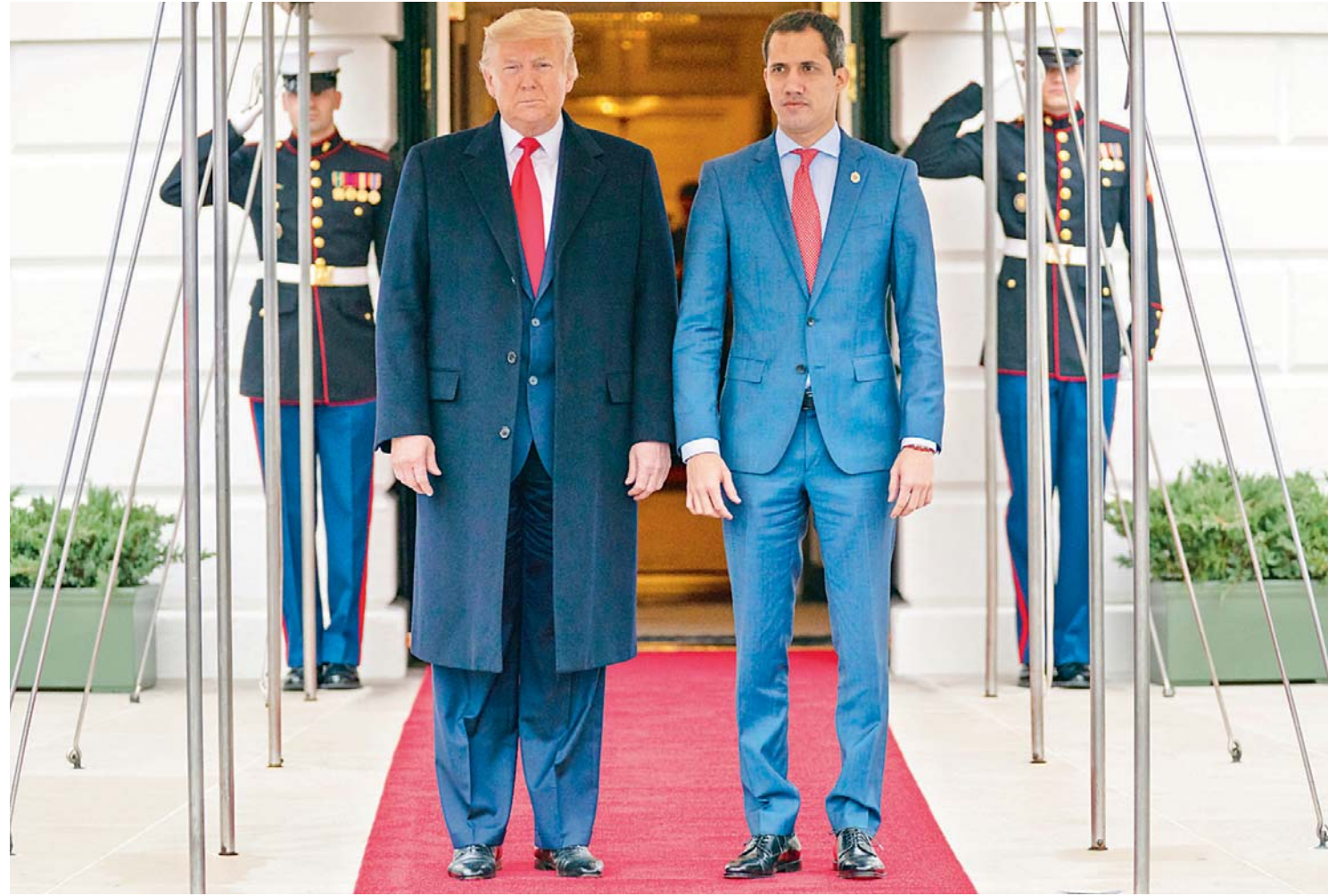
President Donald Trump welcomes Venezuelan opposition leader Juan Guaido to the White House in Washington.