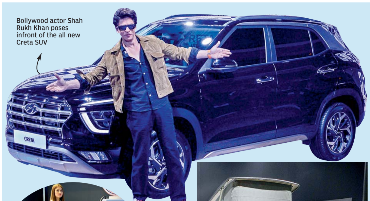
Bollywood actor Shah Rukh Khan poses in front of the all new Creta SUV

Korean brand Hyundai, India's second biggest car maker, took off the covers of the India-specific, second-generation Creta SUV on Thursday. Revealed as the new-generation ix25 in China last year, the new