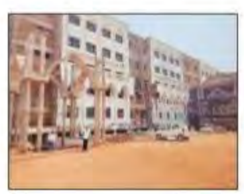
Shaheen Primary School in Bidar. File