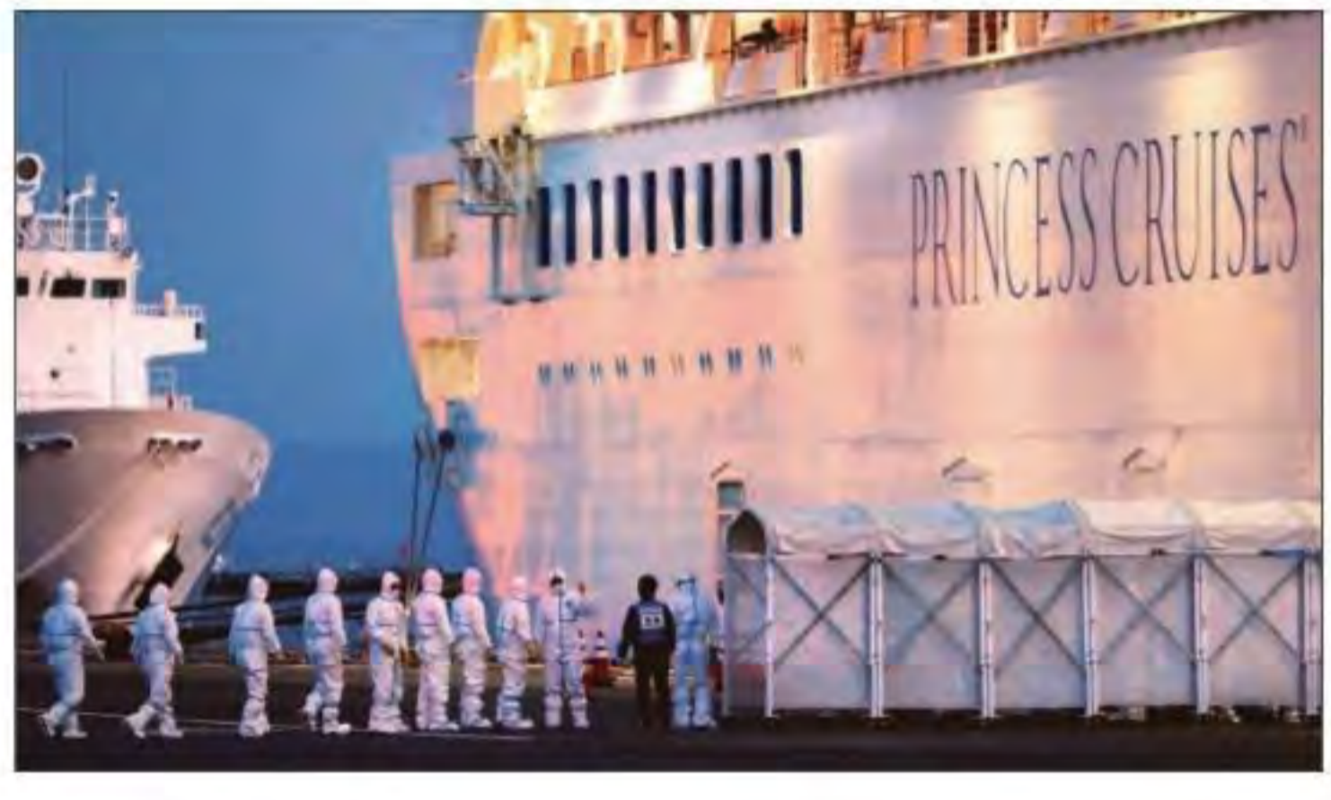
Officials enter Diamond Princess to transfer a patient to hospital in Yokohama, Japan.