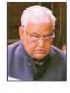
Kirodi Lal Meena

arate from a government Bill, and is piloted by an MP who is not a Minister. Individual MPs may introduce private member's Bills to draw the government's attention to what they see as issues that require legislative intervention.