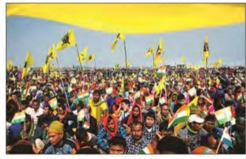
The rally on Friday in Kokrajhar to celebrate the signing of a peace accord with National Democratic Front of Bodoland.

THE GOVERNMENT expects the bulk of those who file I-T returns to shift to the new simplified tax regime which does away with exemptions for long-term savings. More disposable income is expected to boost demand, and give an immediate fillip to growth. But lower savings will affect growth in the long-term, since less savings would mean less funds available for investments by businesses.