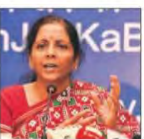
Nirmala Sitharaman in Mumbai, Friday.

Bhushan Pandey said that the Income Tax department had run a simulation on about 5.8 crore tax returns. It showed that 69 per cent of existing tax payers will benefit from the new slabs while 11 per cent would see no change in their tax outgo by switching to the new system. Thus, the government's expectation is that 80 per cent will switch to the new system, which some experts had criticised as being too complicated since it had more income slabs.