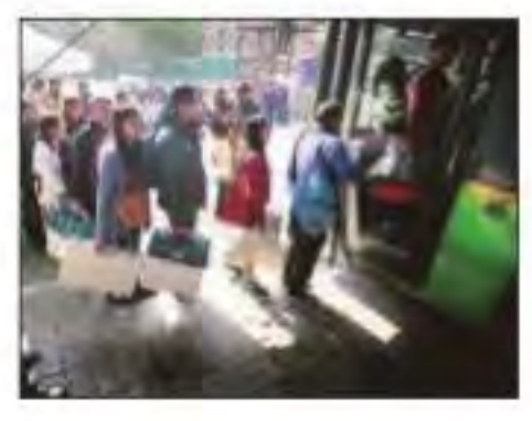
Poll officials with EVMs at Gole Market in New Delhi, Friday.

Equipped with booth-wise electoral rolls and phone numbers which, he said, are easily