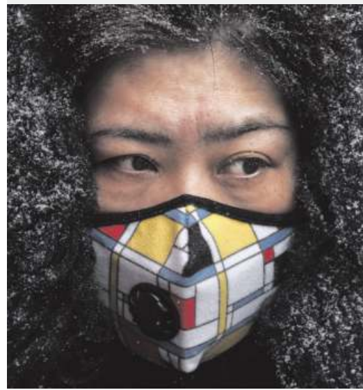
Growing fears: A Chinese woman with a protective mask in Beijing, China, on Wednesday.

The toll continues to rise due to the new coronavirus as authorities scramble for more beds, medical facilities and masks amid the outbreak