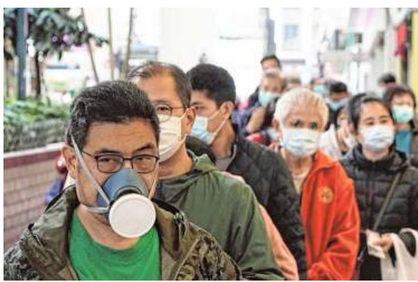
In high demand: People queuing up to buy masks in Hong Kong, which has reported 25 confirmed cases, on Friday.

"We deeply mourn the death of Wuhan doctor Li