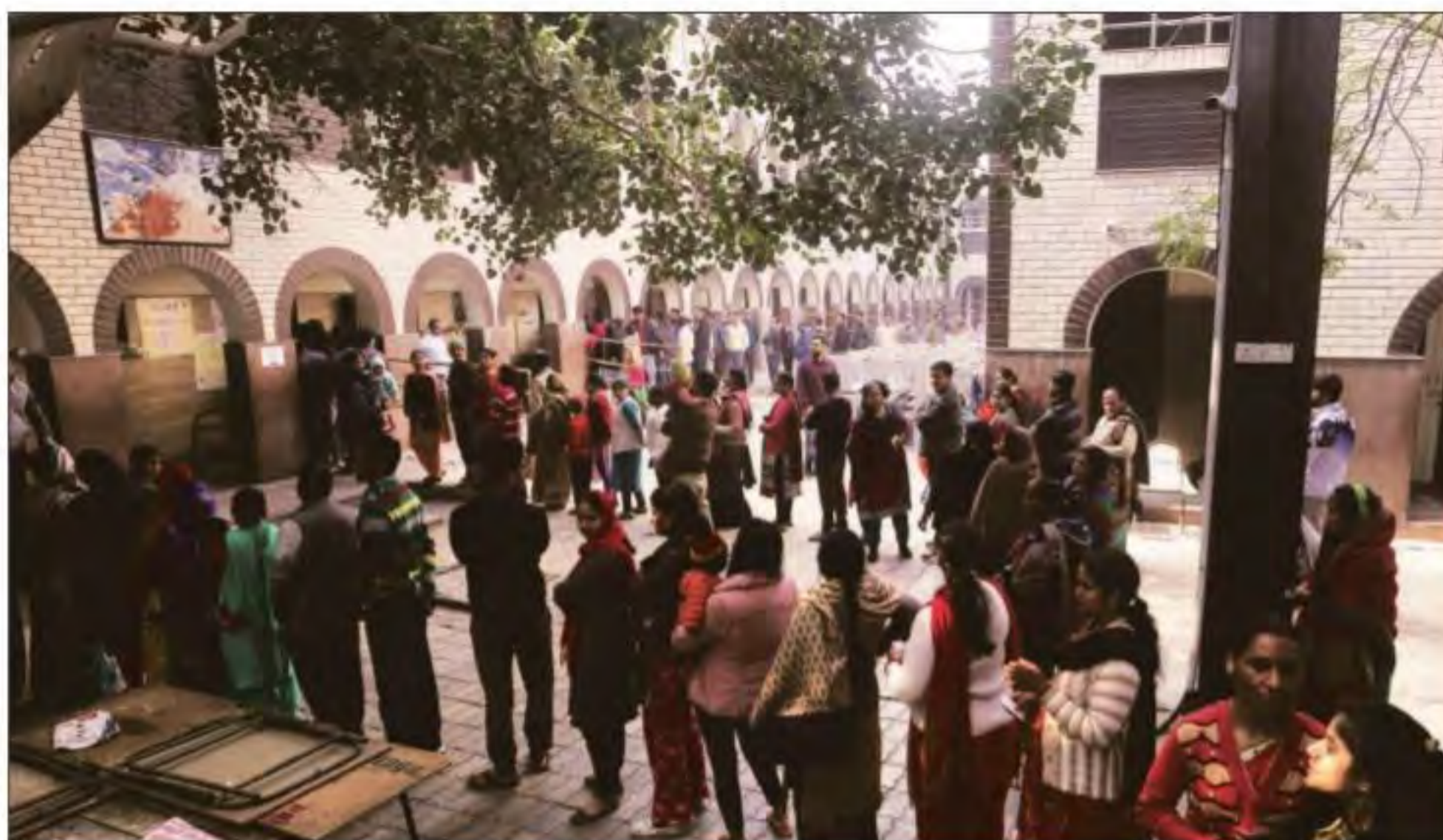
Voters wait outside a polling station at a government school in East Delhi on Saturday.