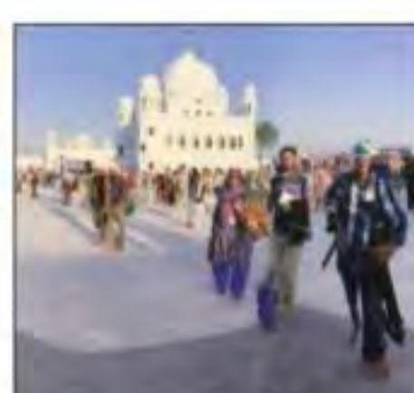
The Gurdwara Darbar Sahib corridor opened last year

"As per procedure, pilgrims can visit the corridor from dawn till dusk after producing Indian