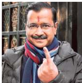
Delhi CM Arvind Kejriwal.