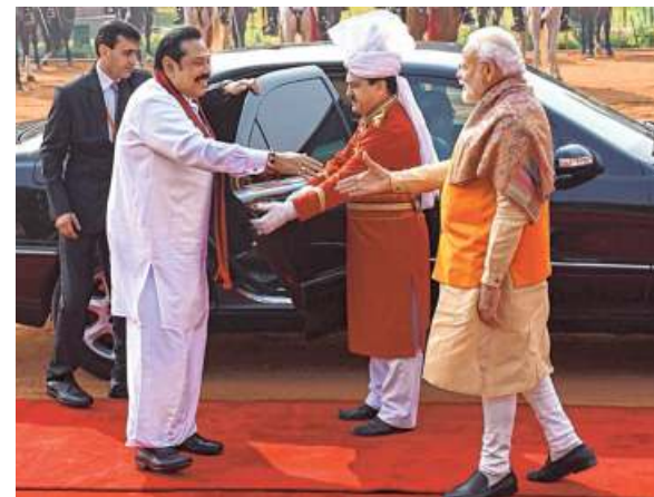
Warm welcome: Sri Lankan PM Mahinda Rajapaksa with PM Narendra Modi in New Delhi on Saturday.