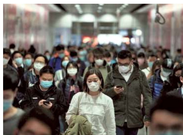
In the grip of fear: People wearing masks leaving a subway station in Hong Kong.

CLASSIFIEDS ▶ PAGES 6 & 7 MAGAZINE ▶ 12 PAGES