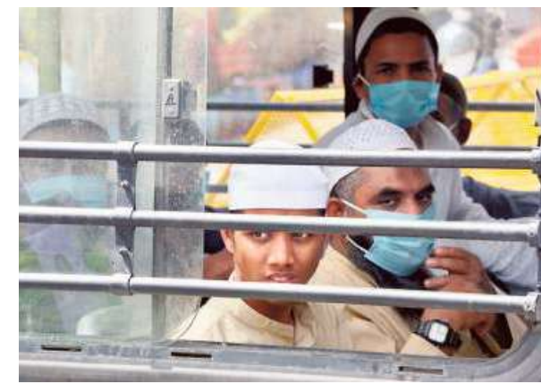
People being evacuated from Nizamuddin centre in the city on Tuesday.

In the March 25 letter, priest informed the local Station House Officer (SHO) that they were trying to shut down the centre as directed