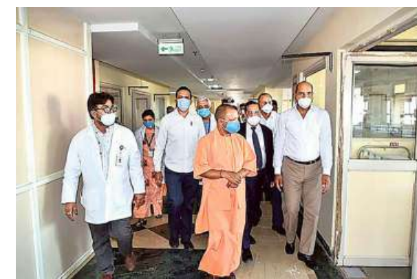
Chief Minister Yogi Adityanath inspects the isolation ward of a hospital in Greater Noida.

In Ghaziabad, Chief Minister Yogi Adityanath inspected the preparations at Santosh Medical College before