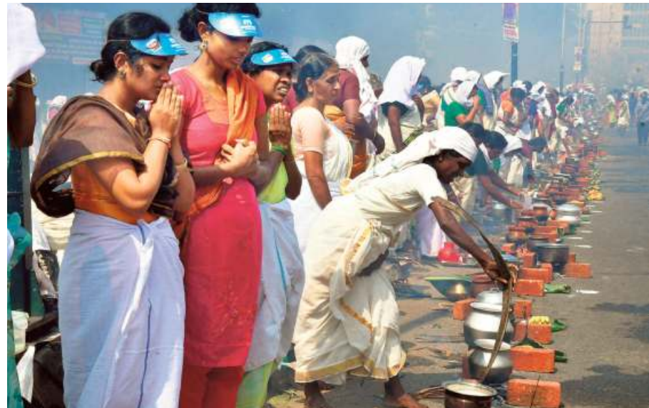
Religious fervour: Women cooking Pongala, a sweet dish, during the annual festival at the Attukal Bhagavathy temple in Thiruvananthapuram on Monday. Despite concerns over fresh cases of COVID-19 in Kerala, lakhs of devotees took part in the women-only event.