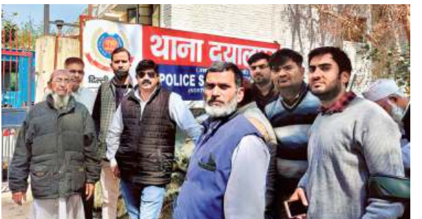
Families of the three arrested men outside the Dayalpur police station on Monday.