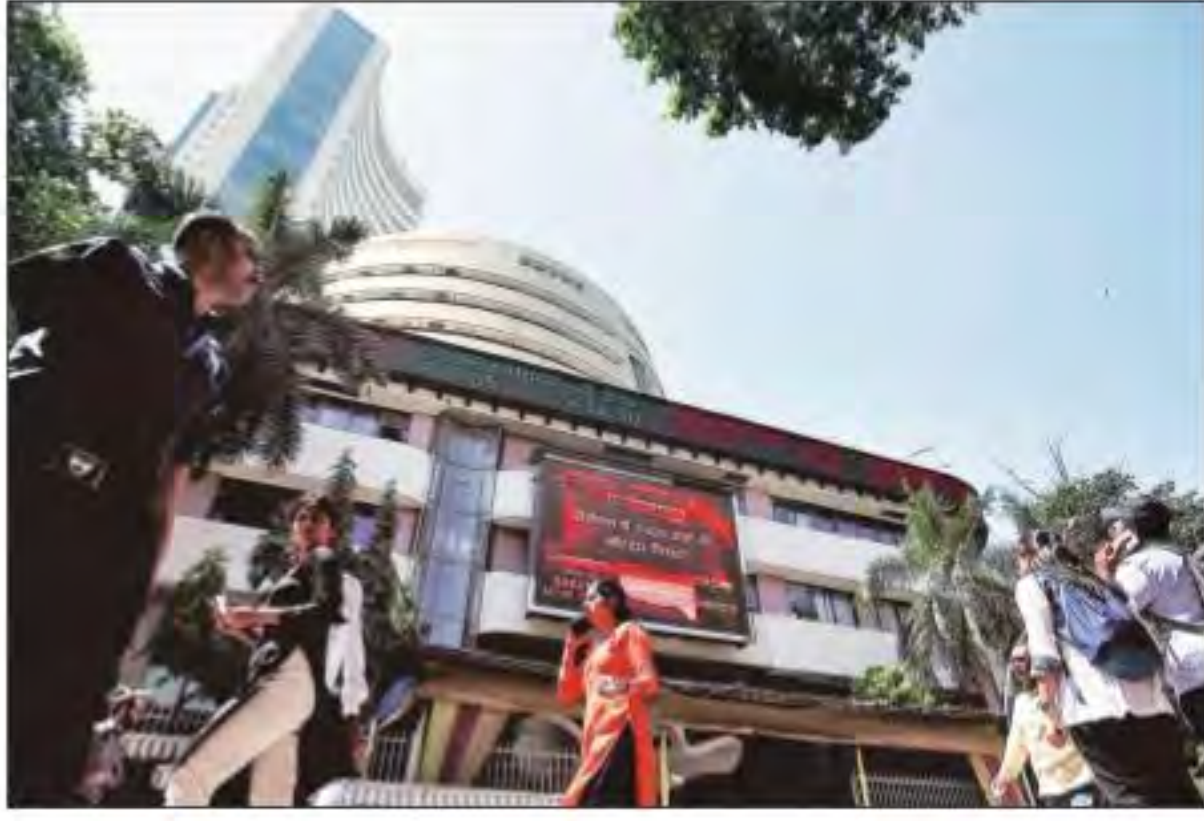
The Bombay Stock Exchange shed 1,942 points, Monday; workers sanitise a DTC bus in Delhi.