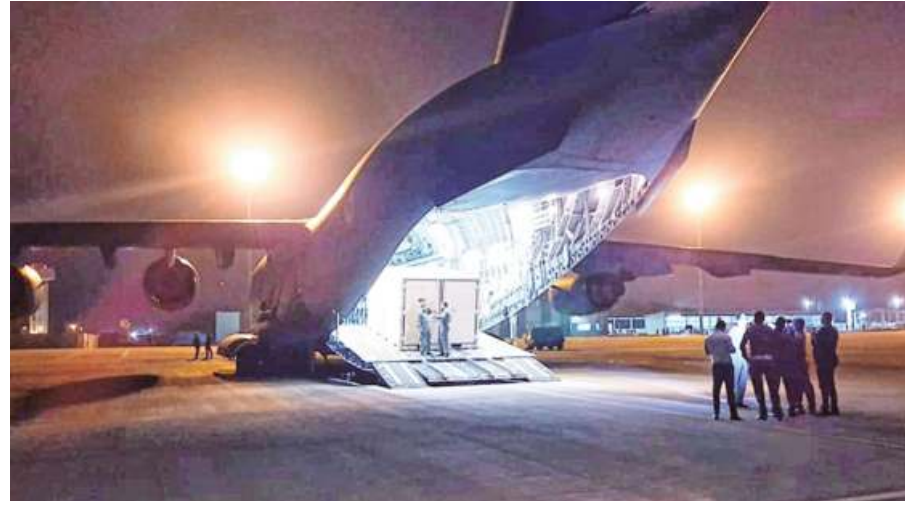
Rescue mission: The C-17 Globemaster transport aircraft being loaded with facilities to quarantine the passengers before it took off from Hindon airbase.

According to reports, the number of cases of novel coronavirus worldwide has crossed 1,10,000 in 100 countries and territories with more than 3,800 dead.