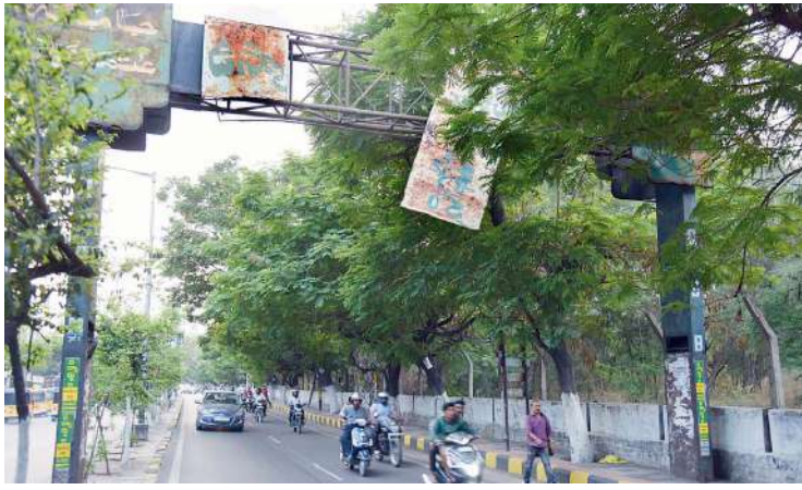
A portion of a rusted signboard in front of RTC hospital near Tarnaka hangs precariously and poses a danger to vehicles and people walking on the road.