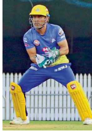
CSK skipper M.S. Dhoni during a training session at M.A. Chidambaram Stadium on Monday.