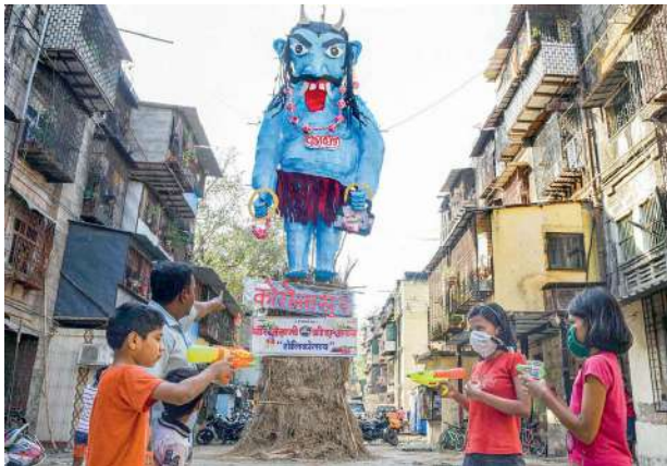
A view of an effigy based on the theme of novel coronavirus for Holika Dahan in Mumbai on Sunday. —PTI