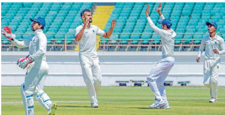
Bengal players celebrate a Saurashtra wicket on the first day of the Ranji Trophy final at Rajkot on Monday.