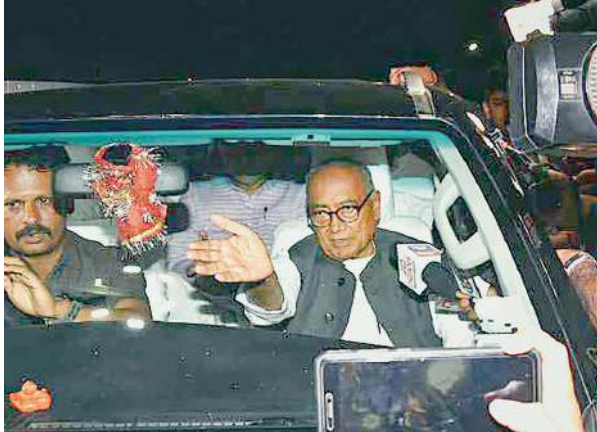
Senior Congress leader Digvijay Singh arrives at Chief Minister Kamal Nath's residence for a meeting in Bhopal on Monday.