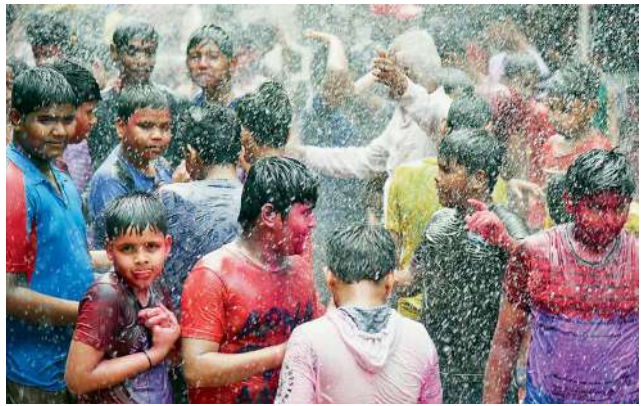
Youngsters enjoying rain dance at Monda Market as part of the Holi celebrations.