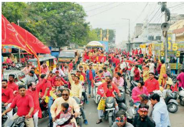
Shia community members take out Sehra processions from various places in the old city to Koh-e-Moula Ali on occasion of birthday of Hazrat Ali.

The devotees had to trek through the Seshachalam hills to reach the Kumaradhara Theertham in Tirumala.