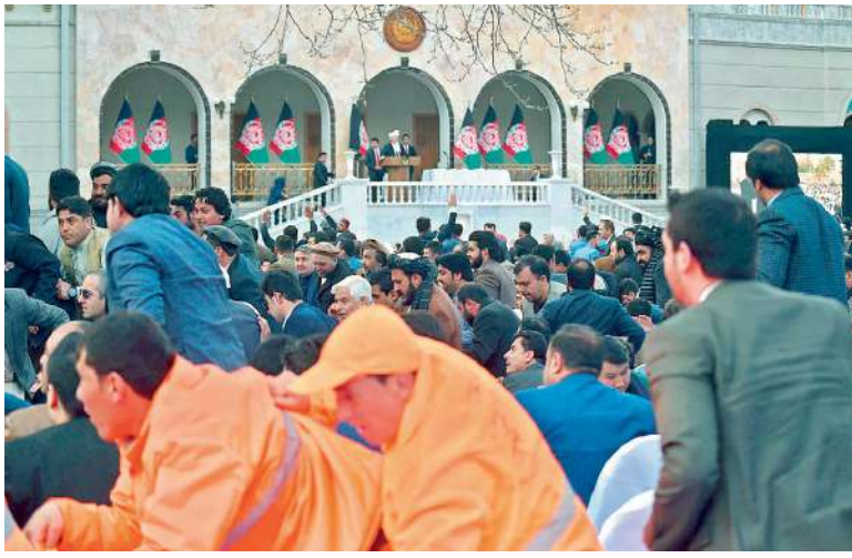
Officials and guests react after hearing loud blasts during Afghan President Ashraf Ghani's swearing-in inauguration ceremony, at the Presidential Palace in Kabul on Monday.