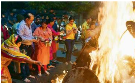
People participate in Holika Dahana at Sindhi colony as a part of Holi celebrations on Monday.