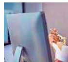
Researchers in evaluating people for problems such as Alzheimer's disease and attention-deficit disorder.