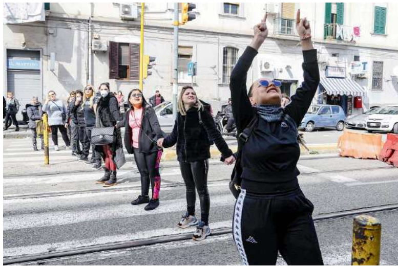
Inmates relatives form a human chain and a road blockade during a protest gathering over measures, including a ban on family visits, outside the Poggioreale prison in Naples on Monday.

Beijing, March 9: China on Monday condemned US Secretary of State Mike Pompeo for branding the Covid-19 as the "Wuhan virus", terming his remarks as "despicable behaviour" and an attempt to stigmatise the Communist nation. The World Health Organisation (WHO) has officially named covid-19 as Covid-19. Chinese Foreign Ministry spokesman Geng Shuang told a media briefing here responding to Pompeo's comments. "Certain US politicians turning a blind eye to science and the decision of WHO has rushed to stigmatise China and Wuhan under the pretext of Covid-19. We condemn such despicable and despicable behaviour," Geng said. Pompeo last Friday repeatedly referred to the Covid-19 as "Wuhan virus", pointing to the Chinese city where the virus first emerged in December last year and also blamed Beijing for not sharing enough information about the disease while putting the US "behind the curve".