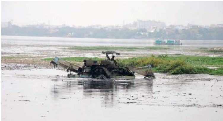
Hussainagar being cleaned up using machines that use modern technology after a massive hike in Budget for city.