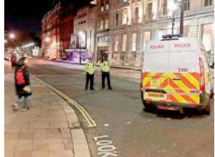
Police stand guard by a cordoned off area after the incident in Westminster, London on Monday.

Images from the scene show police lights flashing in the side road to Great Scotland Yard, the headquarters of the Met Police, where the man was shot.