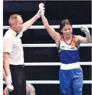
M.C. Mary Kom celebrates after her 5-0 win over Irish Magno of Philippines on Monday.