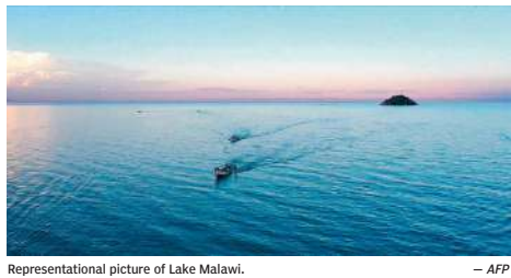
Representational picture of Lake Malawi.